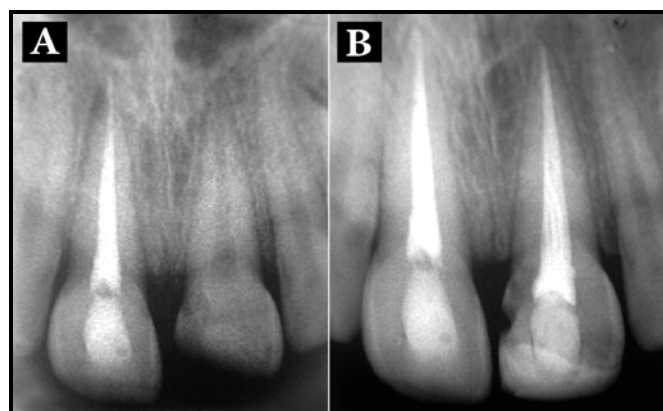
Figure 2. Follow-up radiographic images; A) One month; B) One year

To complete the examination, periapical radiographs were