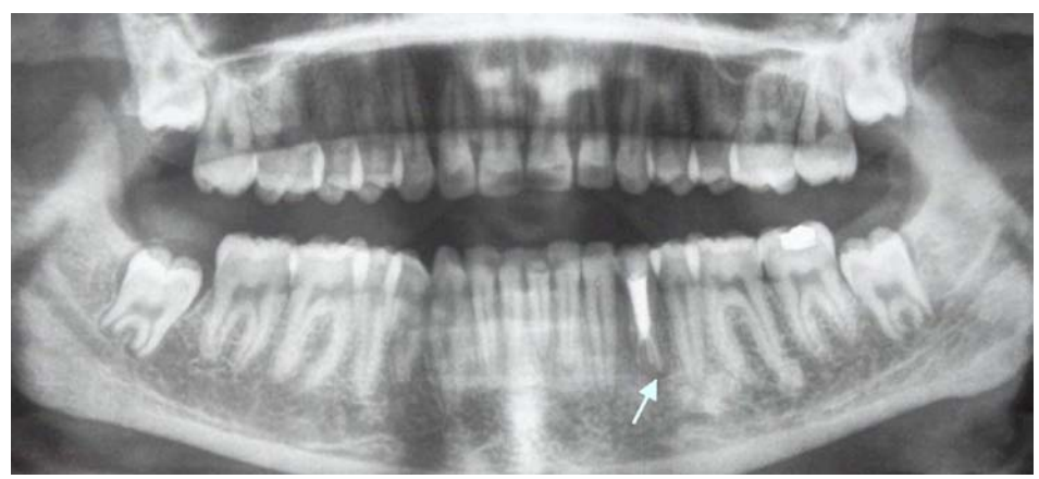
Figure 3. Panoramic view showing obturation of unilateral three rooted mandibular left first premolar

Maillefer, USA) using AH Plus sealer (Dentsply, Maillefer, USA) (Figures 1C and 1D).