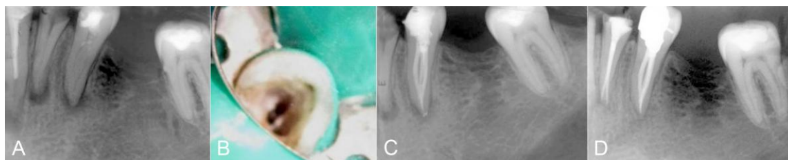
Figure 2. A: Preoperative radiograph of three-canal second mandibular premolar with periapical lesion. B: Access reveals two buccal canals and one lingual canal. C: Post operative radiograph after treatment. D: Six month follow-up.