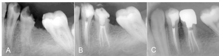
Figure 1. A: Three-canal second premolar. B: Immediate post operative radiograph showing three canals with three portals of exit. C: One-year recall.

revealed caries in teeth #20, 21. Vitality tests on both teeth showed painful response to cold, heat and electric pulp test (EPT) and normal response to percussion. Radiographic examination showed normal periodontium and more than one root canal was suspected in both teeth (Figure 1A).