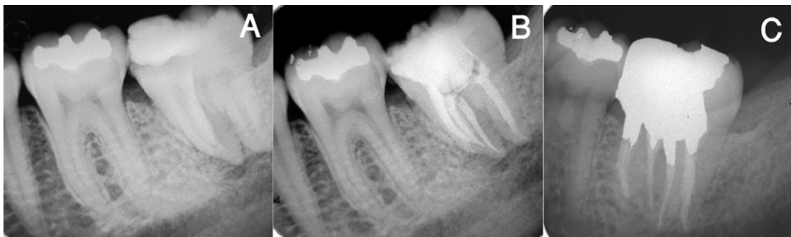
Figure 4. A) Periapical view of the left lower second molar, B) Final periapical radiography, C) Periapical view on one-year follow up

reported by Tsisis et al. , the two cavities were separate and therefore the dentin septum was preserved (2).