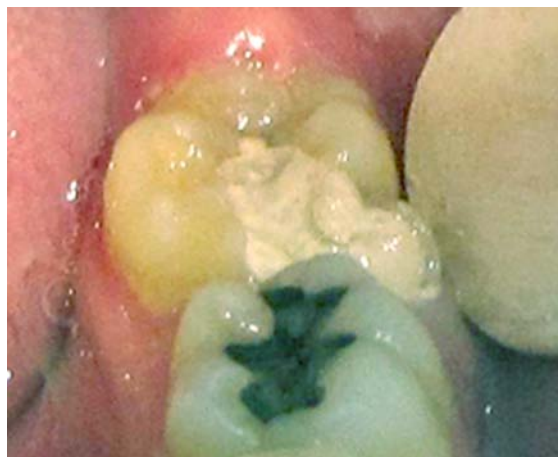
Figure 2. Abnormal morphology of the lower second molar with larger crown suggestive of fusion with another supernumerary tooth