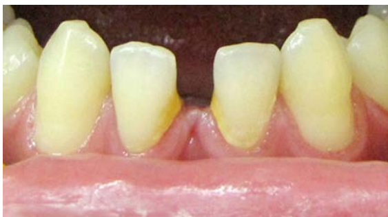
Figure 1. Missing lower central incisors