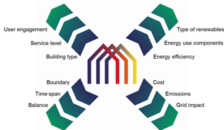
Figure 2. The central elements in the positive energy building definition presented in this article [19].

Figure 2 shows the focus of the PEB definition and the most important elements in this context, based on the EXCESS partners’ inputs and the literature review.