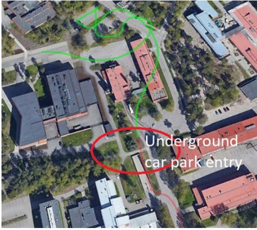
Fig. 2. Good GNSS positioning accuracy and IMU's support in underground parking area with weak signal (green >2m and red <0.5m).

However, the C-V2X enabled RSU and OBU transmit and receive CAM messages with information such as current location, speed etc., which is a potential solution to overcome the above challenge and provide a mean for error correction. The field trial findings indicate that GNSS satellite signals are utilized to ensure the C-V2X stack starting correctly. GNSS-based location information (longitude and latitude) is part of GeoNetworking protocol-based messages routing. Although GNSS-based location can be overruled with a fixed location, missing GNSS satellite signals generating issues with C-V2X stack and limiting possibilities to manage devices. Since GNSS signals does not exist underground and all radio connectivity will be a challenge inside, C-V2X positioning support by utilizing RSU would have limitations in practice.