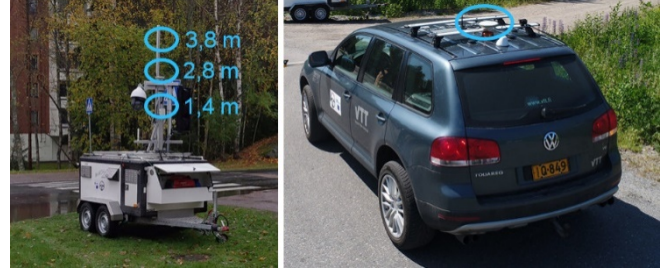
Fig. 4. Variable antenna height installations in C-V2X trials. Roadside installations (left); roof rack installations on test vehicle 'Marti' (right).

Development Platform. The used antenna in this setup were NMO4E5350 from PulseLarsen Antennas. The measurements conducted with three different antenna height installations on trailer: 1.4 meter, 2.8 meter and 3.8 meter. Such heights were chosen to represent the most common positions where a C-V2X antenna could be installed, being the average height of a vehicle, a roadside traffic light height and an over-the-road traffic light gantries height respectively. Test vehicle 'Marti' had a fixed height for all measurements, 1.8 meter. Both the test vehicle 'Marti' and the trailer 'Marsu' were equipped with the same hardware.