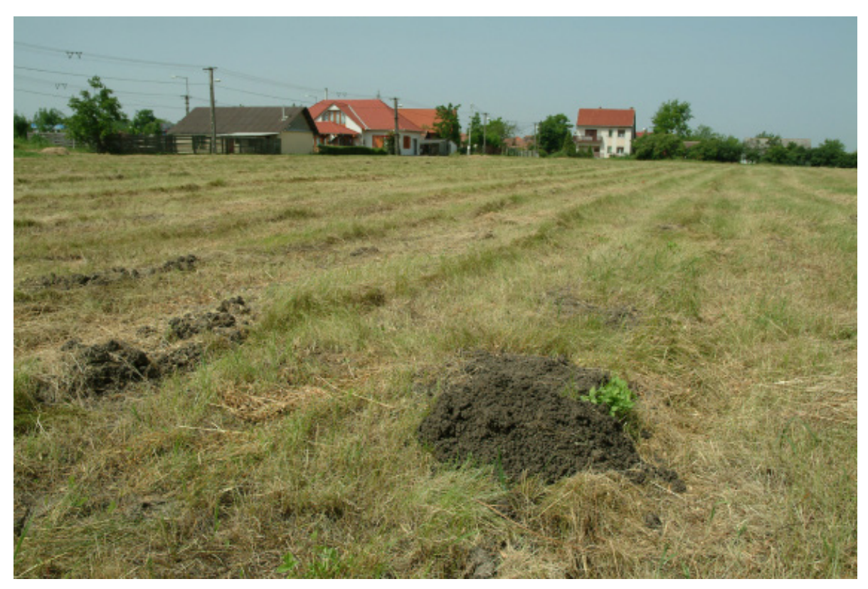
Figure 5. In many cases, property development poses imminent threat to the remaining population fragments (Mezőtúr, Hungary).

our times is property development, the construction of new suburbs, industrial parks, solar panel parks, shopping malls, parking lots, and other types of built-up areas. In Hungary, some blind mole-rat populations can be found within settlements (Figure 5). Most of the land in these cases is the property of the municipality and impending industrial investments can mean complete eradication (Krivek 2014; Sendula 2014). A Serbian population inhabits a popular vacation resort, where actual and planned development projects may result in losing the entire population (Németh et al. 2013c; Krivek 2014). Road construction can also annihilate populations. This is an omnipresent risk factor in all countries of the region that mainly concerns non-protected areas. In Hungary, one subpopulation disappeared due to the contruction of a new highway exit (Németh et al. 2013c).