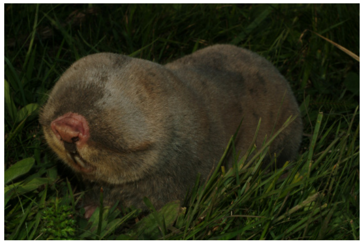
Figure 1. Spalax antiquus (Aiton, Romania) in its natural habitat.

Lesser blind mole-rat, Nannospalax (superspecies leucodon; Musser and Carleton 2005). Although the species status of taxa differentiated solely on chromosomal grounds has not been widely accepted (Sözen et al. 2006; Ivanitskaya et al. 2008; Kryštufek et al. 2012), the results of the until now fairly limited molecular genetic investigations of this superspecies (Hadid et al. 2012; Németh et al. 2013a) and the results of breeding experiments with several Central European and Balkan chromosomal forms (Savić and Soldatović 1984) raises the necessity of species level separation at least of some of them. Alongside with taxonomic uncertainty the determination of conservation status of different mole-rat taxa is further hampered by their exclusively subterranean lifestyle which makes it difficult to evaluate their population size. While the leucodon-superspecies itself was categorised for a long time as Least Concern (Temple and Terry 2007, 2009), and changed recently to "Data Deficient" (Kryštufek and Amori 2008) to express the systematic problems within the group, while populations and habitats of many different European chromosomal taxa are disappearing at an alarming rate, a phenomenon which has just recently been realized (Kryštufek 1999; Kryštufek and Amori 2008; Németh et al. 2009).