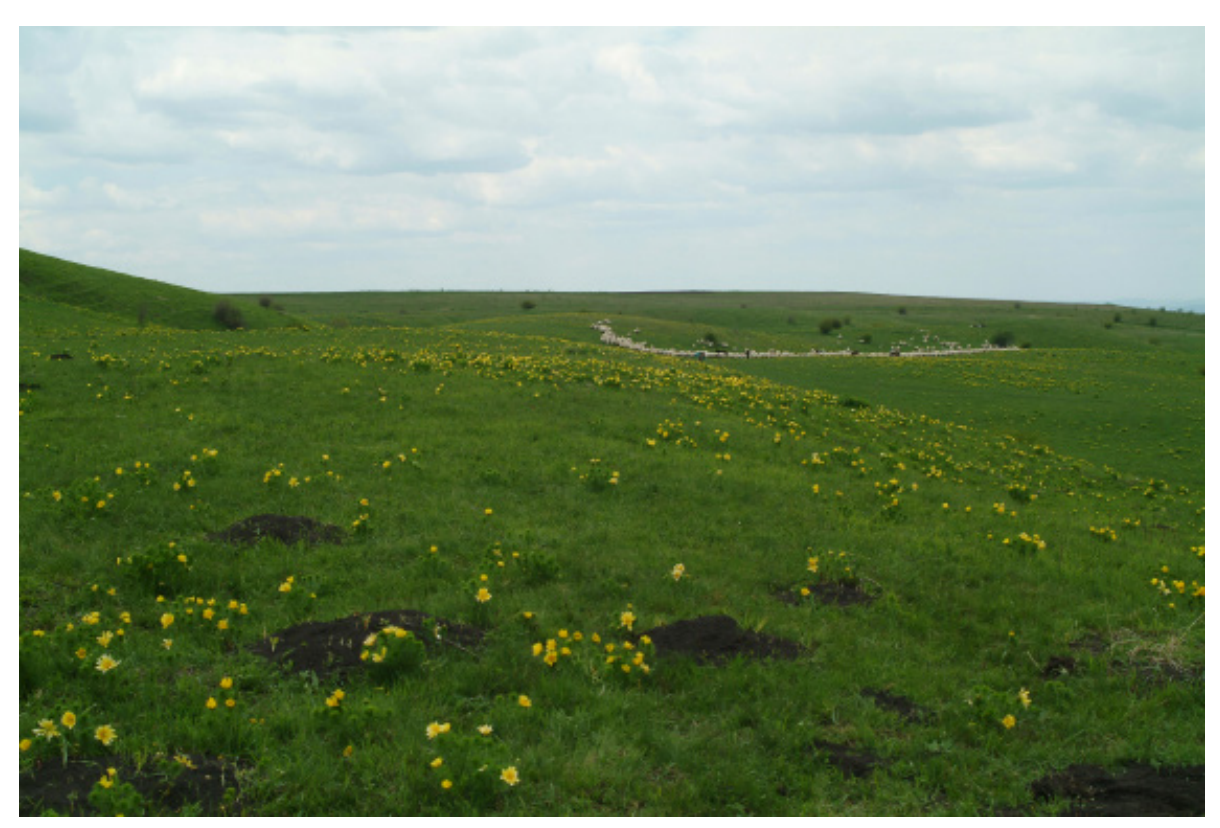
Figure 4. Vast, dry grasslands are the typical habitats of blind mole-rats (Aiton, Romania)

The very first and most rapid changes in habitat structure took place in Hungary between the second half of the 1950s and the 1970s. A similar progression started in Transylvania at the same time, however on less extensive areas, owing to the scarcity of vast plain areas adequate for large-scale agriculture. Grassland habitats of Vojvodina were affected in the 1990s. As a consequence of habitat deterioration blind mole-rat populations retreated to remnant grassland fragments and became completely isolated from each other. Recent regional development and urbanisation had particularly adverse impacts on the remaining blind mole-rat populations of Hungary and Vojvodina (Németh et al 2013c; Krivek 2014; Sendula 2014). In the early 2000s only five populations in Hungary and two in Vojvodina were recorded (Horváth and Vadnai 2006; Delić 2007), and there was no information on either the localities or the size of mole-rat populations in Transylvania.