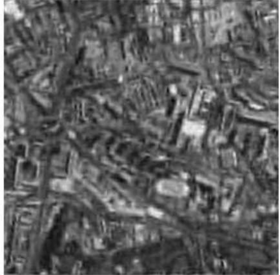
Figure 2: Original image (top), degraded image (center), and restored image (bottom).