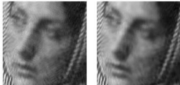
Fig. 2. Cropped versions of Barbara denoised using 4-bands wavelets: Neighblock estimator (left), proposed one using PN2 neighborhood (right).