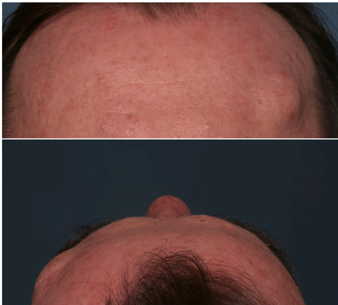
Fig. 1. Image of case report with hyperostoti mass. The hyperostotic bulge can be observed on the right (in the photo), left (for the patient) both in the frontal (top) and upper transversal (down) images.

Post-op was normal, no side was detected, in 3 days the patient was discharged with a small increase in the major inflammatory serum markers (ESR from 8 mm/h to 32 mm/h, CRP from 4 mg/L to 9 mg/L,