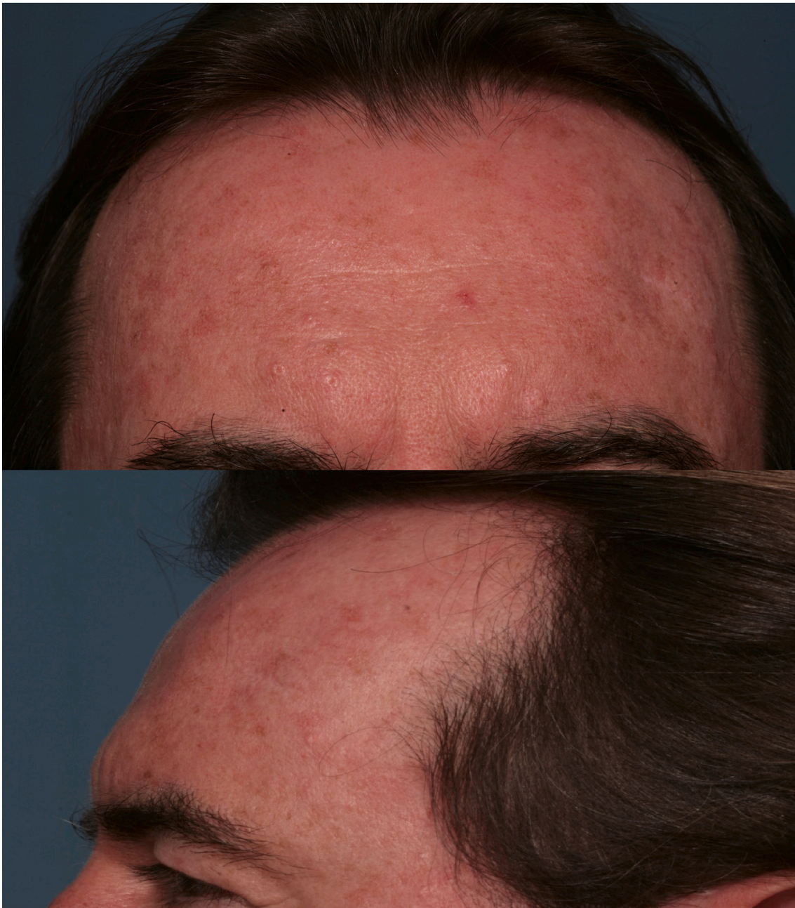
Fig. 4. Post-op photos of the case report: Top: Frontal image, down: lateral image. The hyperostotic mass is disappeared.

and osteoplasty, which requires the use of micro-vibrations of ultrasonic frequency scalpels. The principle of piezosurgery is ultra sound (US) transduction [22], obtained by piezoelectric ceramic contraction and expansion. The vibrations are amplified over the bone and results in the presence of irrigation with physiological solution, in the cavitation phenomenon, with a mechanical cutting effect exclusively on mineralized tissues, preserving soft tissues (such as periostium) from injuries, and thus enhancing a faster recovery [23]. Periostium provides blood supply which is fundamental for bone integration of the autologous graft and to avoid peri-operative complications, such as infections, dehiscence and delayed wound healing [24].