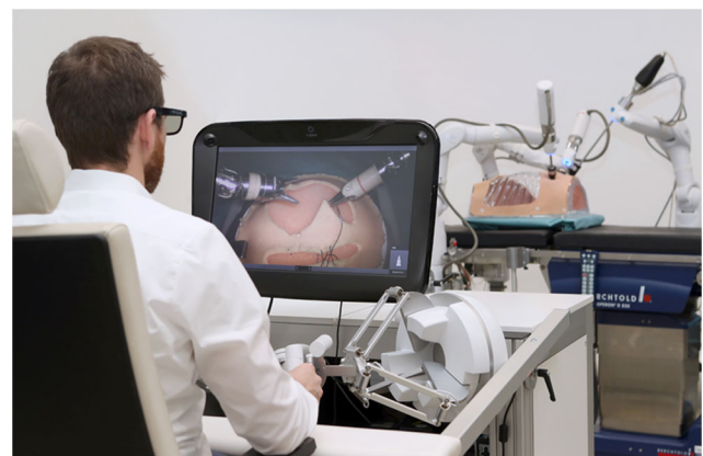
Fig. 6 MiroSurge—The DLR research platform for telemanipulation in minimally invasive robotic surgery