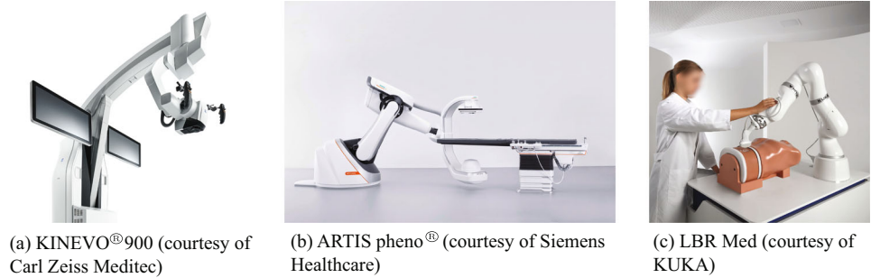
Fig. 4 Other examples of robotically assisted surgical systems

into the patient. Secondly, it has to provide the surgeon with all necessary information from the surgical site.