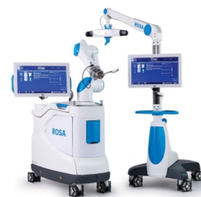
(c) ROSA ® Knee System (courtesy of Zimmer Biomet)

Inc. (Audubon, PA, USA)) [37] and the neuromate ® System (Renishaw plc (Gloucestershire, UK)) (cmp. [38]).