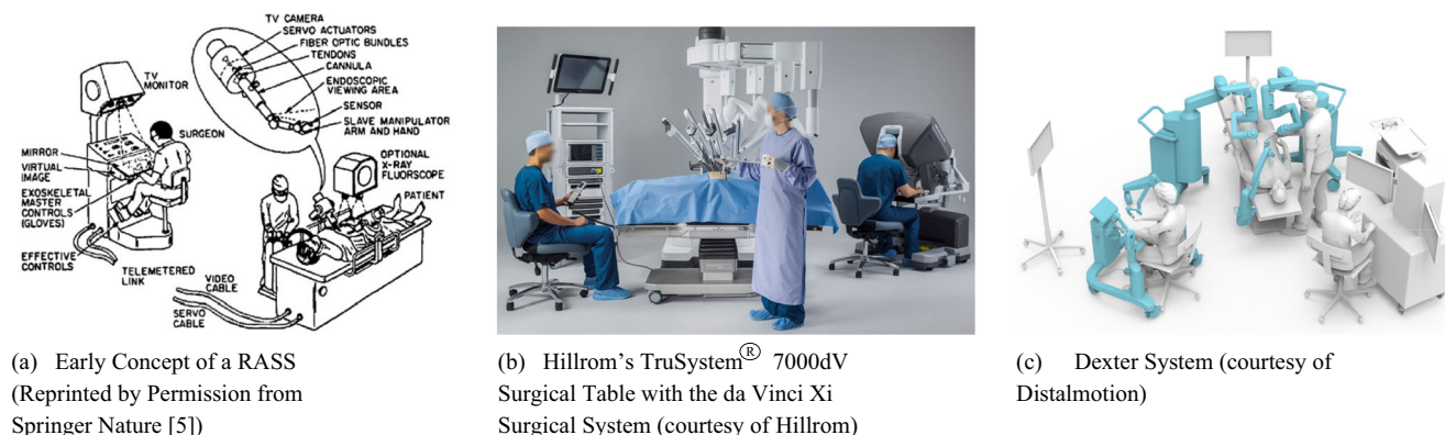
Fig. 1 Telematipulation in robot assisted surgery

In the field of minimally invasive surgery, the NASA concept was advanced by various research institutes from the mid-1980s onwards. During that time, the US military recognized the potential benefits of the technology for remote-controlled first aid for wounded soldiers and intensively promoted corresponding research. The companies Computer Motion Inc. and Intuitive Surgical Inc. were founded in 1989 and 1995 in Sunnyvale (CA, USA), continuing the research of the NASA and SRI (Stanford Research Institution) respectively for the commercial exploitation of the evolved technologies [10, 11]. In 1993, the AESOP arm of Computer Motion, the first system for positioning an endoscopic camera, received FDA (Food and Drug Administration) approval. In 2001, Computer Motion introduced the ZEUS system for minimally invasive surgery: This system had two arms with different instruments for manipulation tasks, one arm for holding the endoscope and