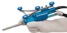
(b) Navio Surgical System