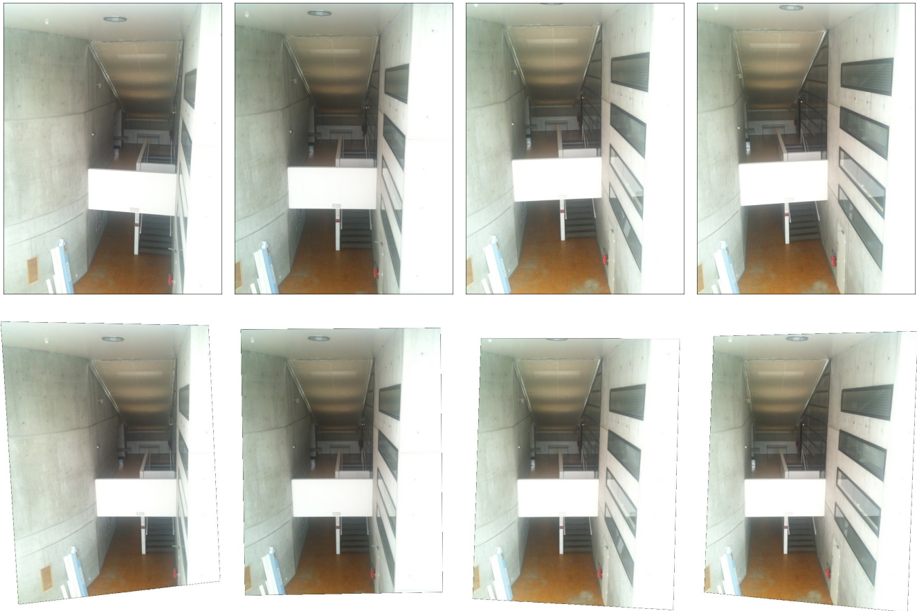
Fig. 5. Multiple image rectification : (Up) four input images. (Down) the four rectified images.