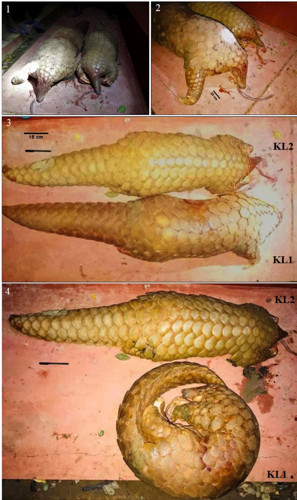
Images 1–4. Photographs of the two Indian Pangolins (coded as KL2 and KL2) taken at the DWC Assistant Director Office at Madu, Mannar District, Sri Lanka.