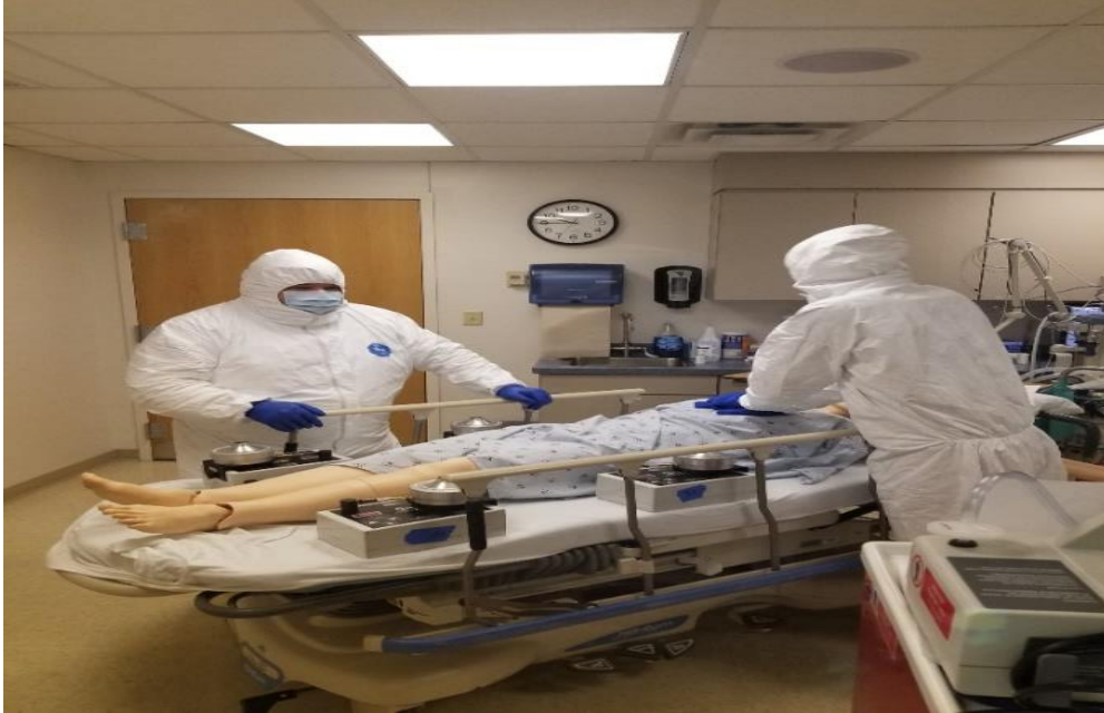
Fig. 11 – Participants wearing surgical mask(SM) and performing simulated activities