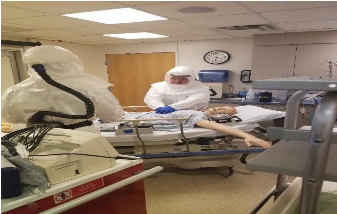
Fig.16 - Participants wearing 3M Versaflo PPR and performing simulated activities