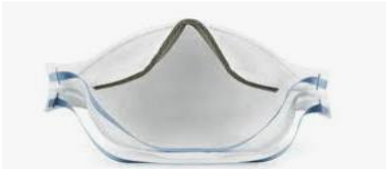
Fig. 6 – 3M N95 9205+ flat-fold respirator (External and internal)