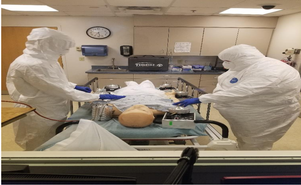
Fig. 13 – Participants wearing 3M N95 8511 and performing simulated activities