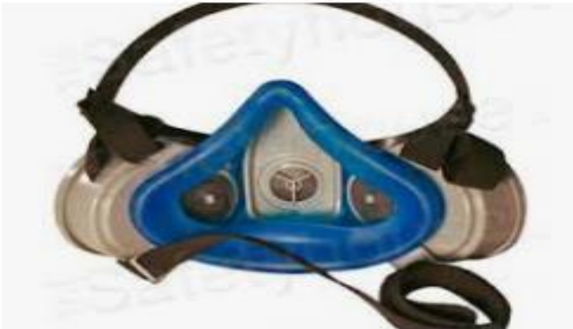
Fig. 7 – MSA Advantage 200LS elastomeric half-mask respirator (External and Internal)