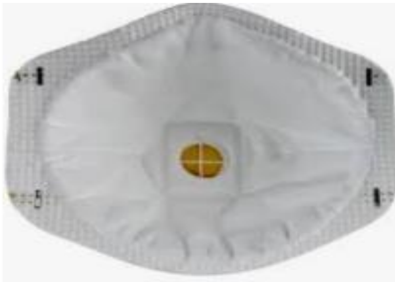
Fig. 5 – 3M N95 8511 cup-shaped respirator (external and internal)