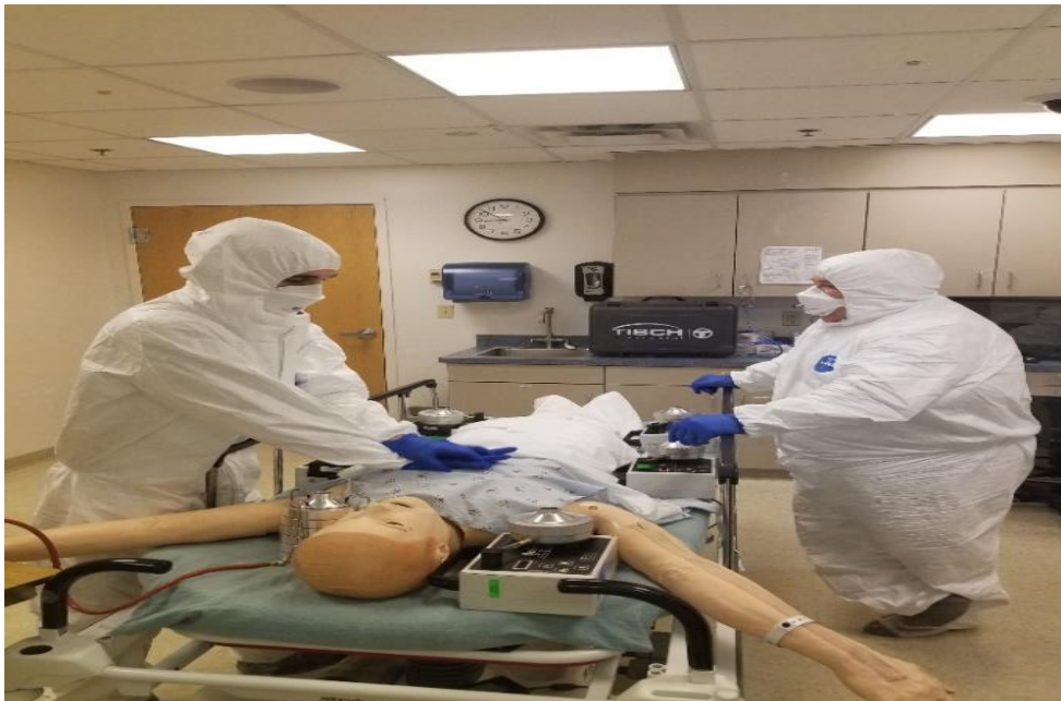
Fig. 12 – Participants wearing 3M N95 9205+ and performing simulated activities