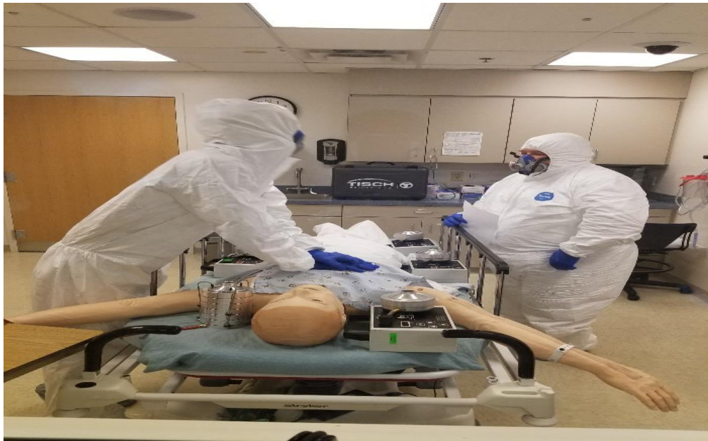
Fig. 14 – Participants wearing MSA half mask (EHMR) and performing simulated activities