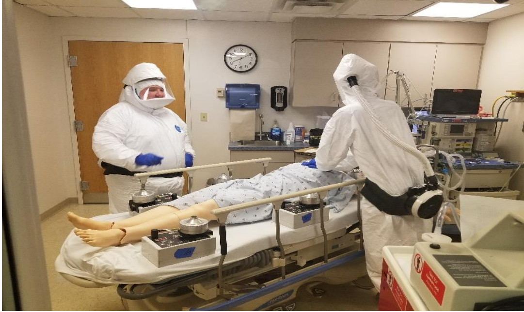
Fig. 15 – Participants wearing Bullard EVA PPR and performing simulated activities