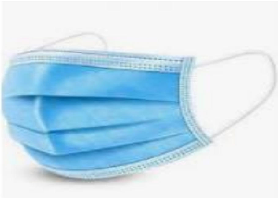
Fig. 4 – Medical Grade Surgical Mask