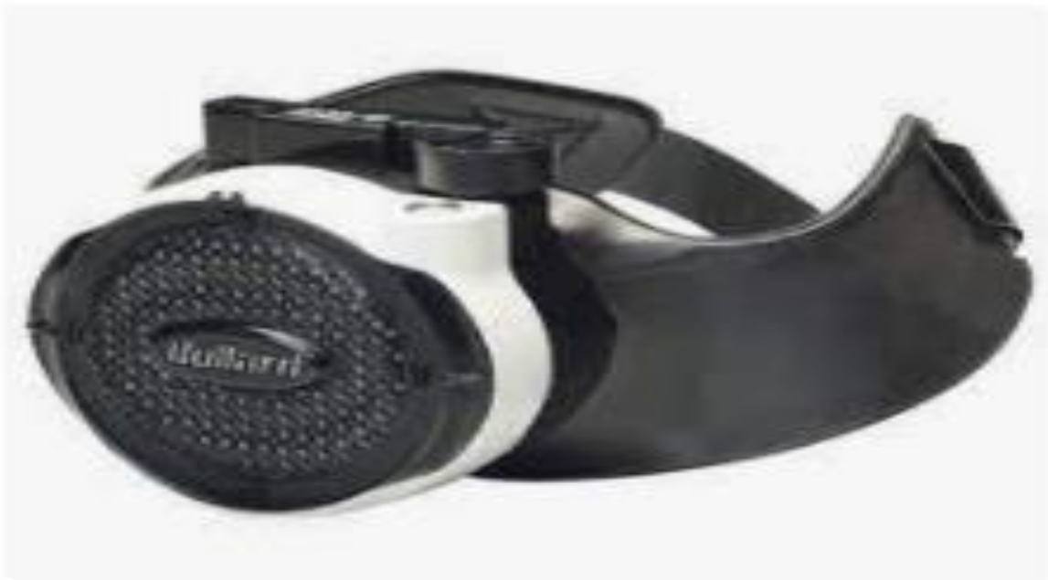
Fig. 8 – Bullard EVA Powered Air-Purifying Respirator with Loose Fitting Hood