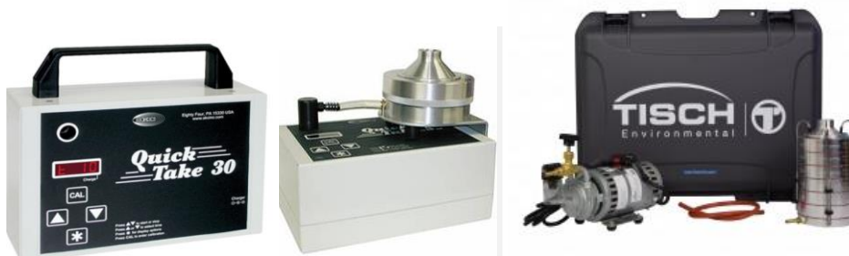
Fig 2. Pictures of the biostage single-stage impactor with the quicktake 30 pump and the andersen 6-stage viable impactor