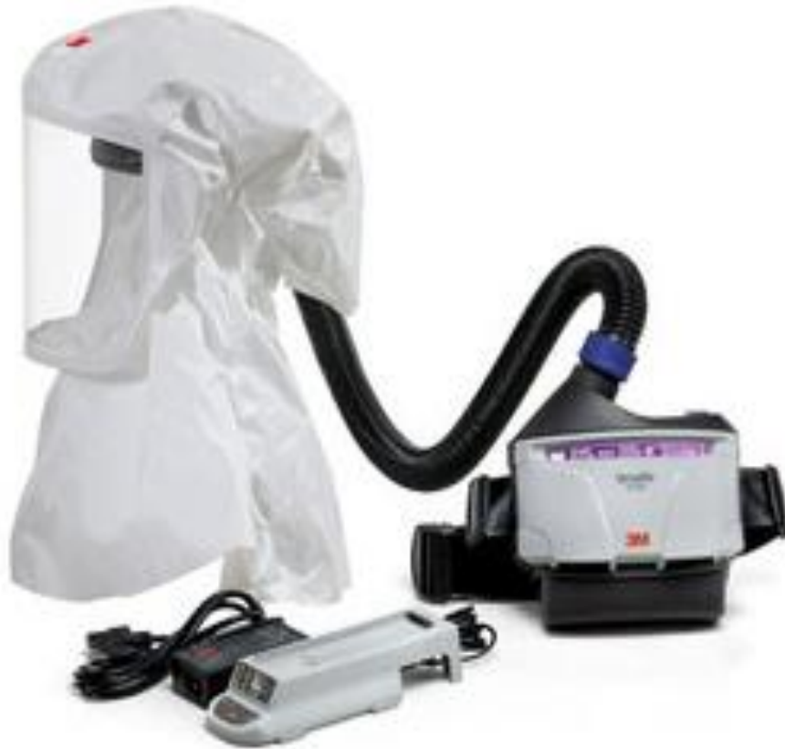
Fig. 9 – 3M Versaflo TR-300 TR-300N +ECK PAPR Assembly kit with headpiece