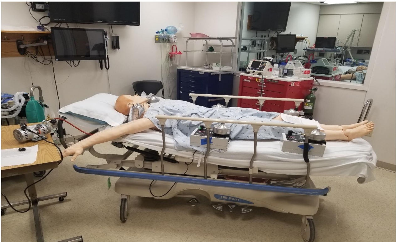
Fig 1. A standard simulated Operating Room at the WVU STEPS center.

This study was conducted at the West Virginia Simulation Training & Education for Patient Safety (STEPS) center, at the West Virginia University (WVU), Ruby Memorial Hospital, Morgantown, WV. The STEPS center can be configured to simulate a typical OR room, as shown in figure 1. Two identical rooms were used. Each room had a volume dimension of 13.5' x 13.5' x '8' and had an air exchange rate (AER) of 25/hr. Eighteen patient care workers familiar with ICU/OR units were recruited from WVU Ruby Memorial Hospital. The choice of subject selection was based on the previous or current experience of working in ICU/OR units. The eighteen patient care workers were paired into nine teams. Each team was made to don six different RPDs while performing typical OR activities such as CPR and reading a rainbow passage to simulate talking.