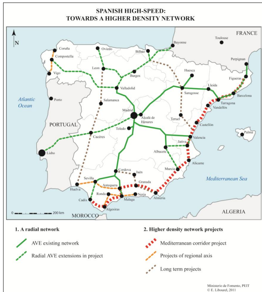
Map 1- Spanish high-speed rail networks

The project of a Mediterranean corridor, part of the TEN-T (Trans-European Networks of Transport) and connecting coastal cities together is the other axis which would give Valencia a nodal position. This axis was in March 2011 declared a priority for the Spanish government. The missing portion of high-speed railway between Tarragona and Castellón should be the first part of it to be built. The urban and regional political actors had a very strong action towards the government and the European Commission to have this Mediterranean axis added to the TEN-T, which was decided in November 2011.