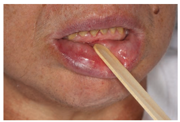
FIGURE 3 - Clinical appearance: multiple asymptomatic nodules.

A 44 year-old, afro-descendent woman, was referred to the Department of Maxillofacial Surgery at Erasto Gaertner Hospital, complaining of an asymptomatic lesion of oral mucosa detected by her dentist during routine examination. Arterial hypertension was the only relevant element of her medical history and she reported hyposalivation. Clinical examination showed multiple asymptomatic nodular lesions on lip mucosa with an average size of 3 mm and normal coloration (Figure 3). Incisional biopsy revealed adenomatoid hyperplasia of minor salivary glands after histopathological examination. After two year's follow-up, the patient has no further complaints and the lesions are stable.