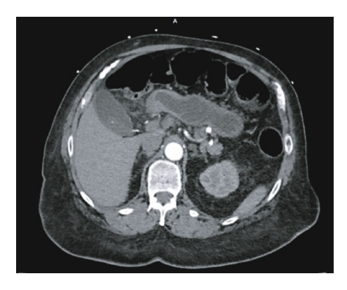
FIGURE 1: Preoperative CT scan shows mild distention of the gallbladder with gallstones and adjacent inflammatory stranding extending to the first and second portion of the duodenum.

Over the next two days, with the addition of a twice daily proton pump inhibitor, the patient's abdominal pain improved significantly and the JP drain output decreased to