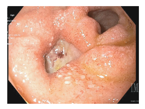
FIGURE 3: EDG shows a large fibrotic, chronic-appearing, penetrating duodenal bulb ulcer with fistulous tract in communication with the surgical drain.