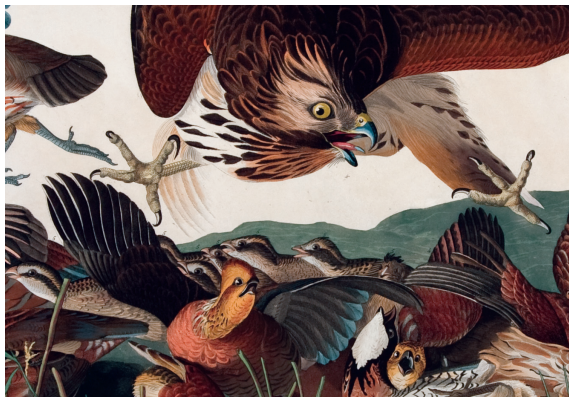
Plate 76: Virginia Partridge (Northern Bobwhite), 1830 Hand-colored engraving with aquatint and etching by Robert Havell Jr. (1793-1878)