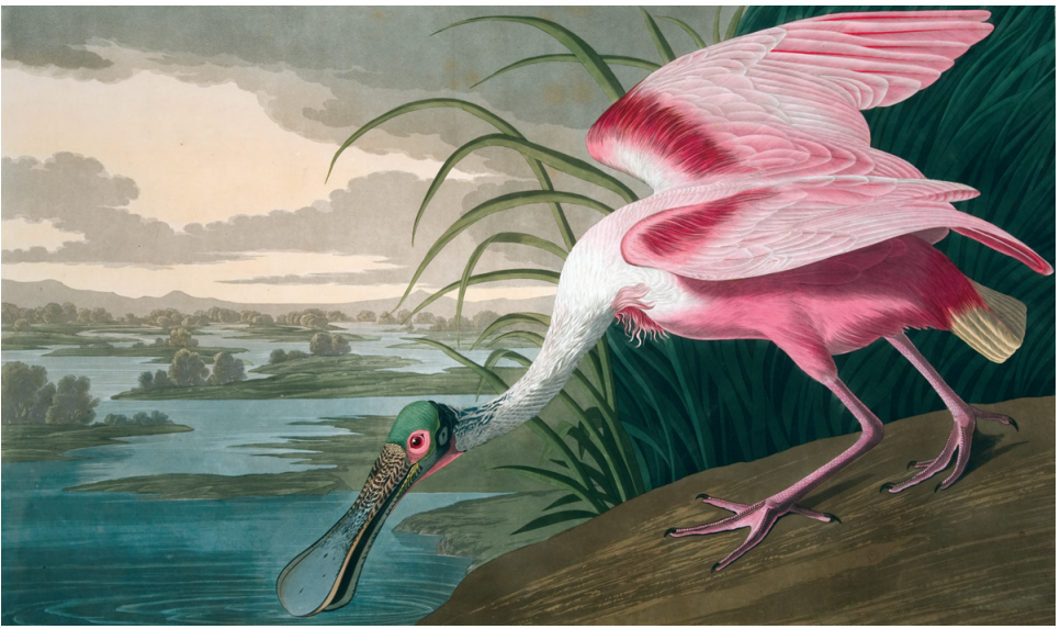
Plate 321: Roseate Spoonbill , 1836.

Hand-colored engraving with aquatint and etching by Robert Havell Jr., (1793-1878)