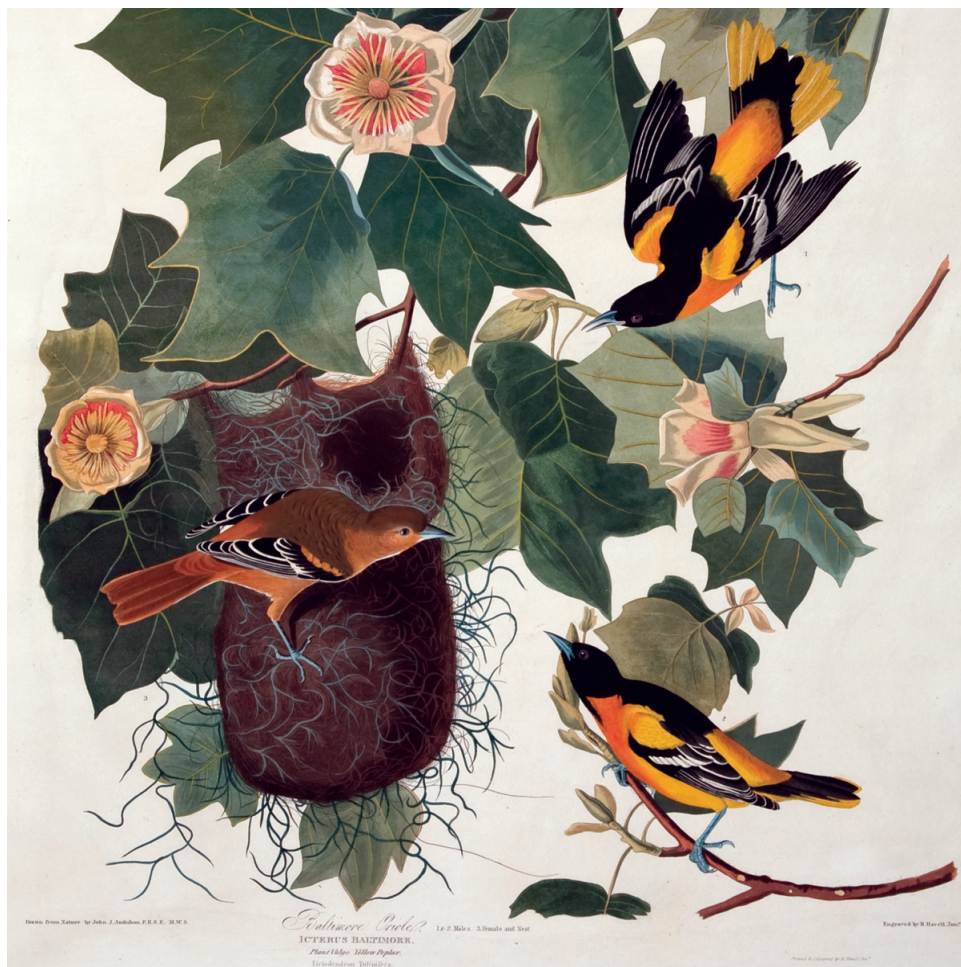
Plate 12: Baltimore Oriole , 1827

Engraving with aquatint and etching by Robert Havell Jr. (1793-1878) and colored by Robert Havell Sr. (1769-1832)