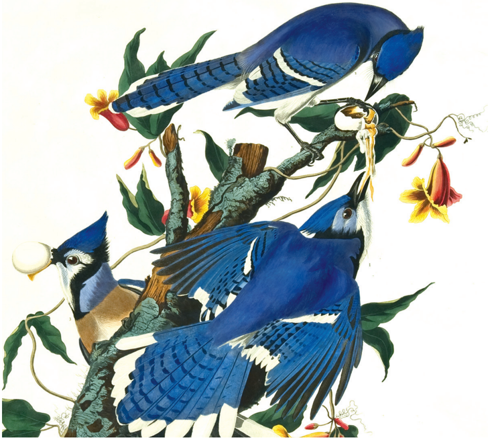
Plate 102: Blue Jay , 1830 or 1831

Hand-colored engraving with aquatint and etching by Robert Havell Jr. (1793-1878)