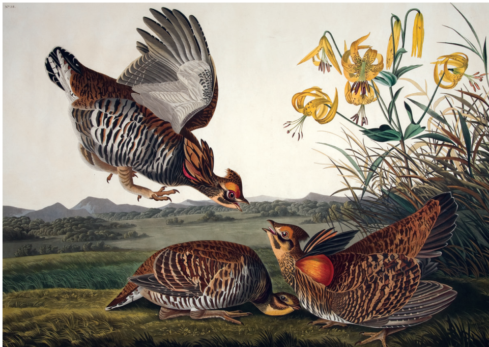
Plate 186: Pinneated Grouse (Greater Prairie Chicken), 1834 Hand-colored engraving, with aquatint and etching by Robert Havell Jr. (1793-1878)