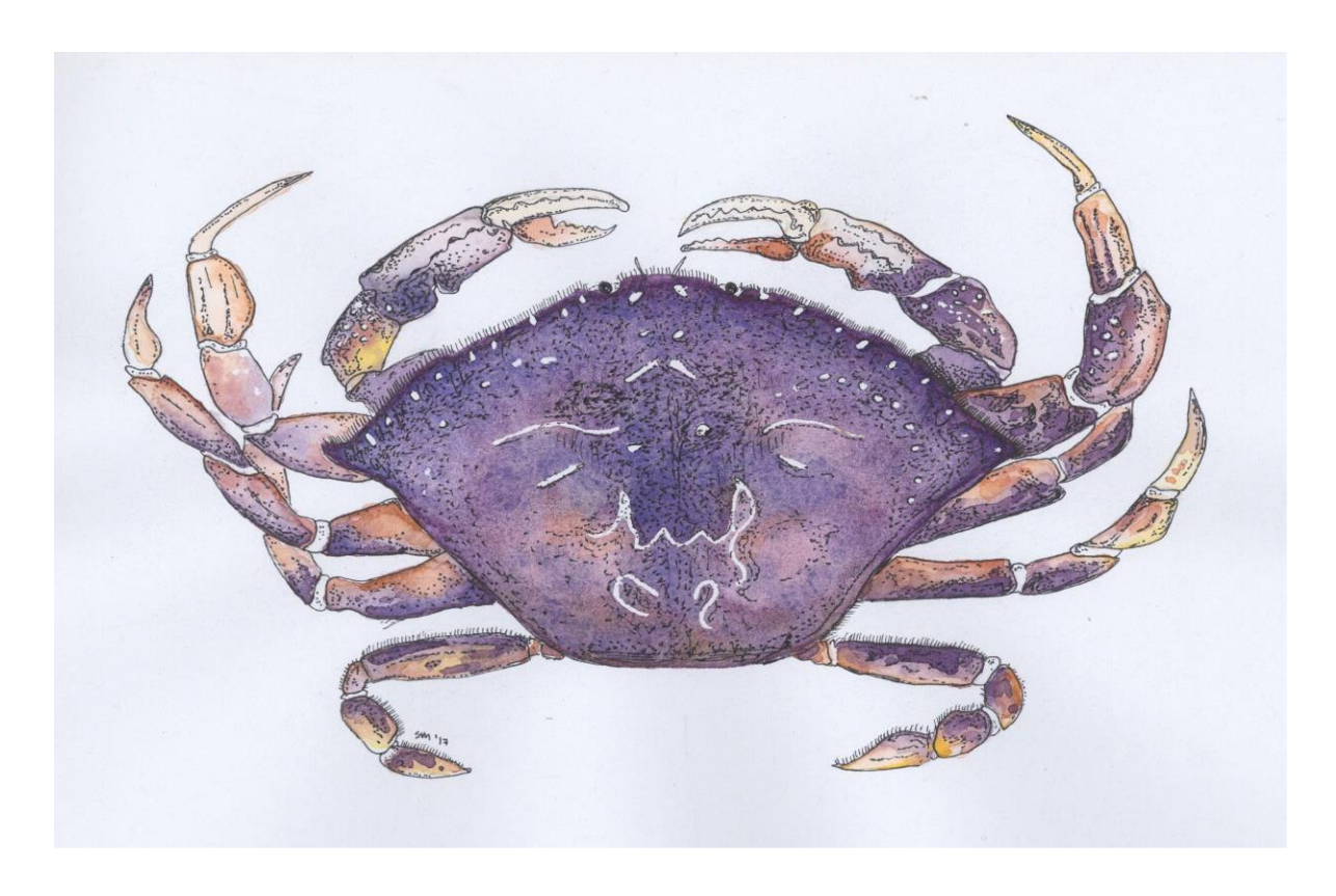
Original watercolour by Skye Maitland (UBC BSN, 2018) for the CRAB Project