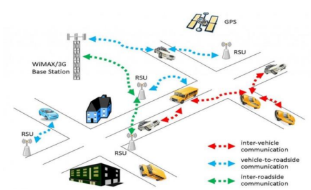
Fig 3. Example of an Intelligent Transport System (ITS) scenario

measures the speed of the vehicle and also the distance traveled by a trip that also estimates the existing obstacles, with a measured and clear estimate, a more mature plan for a trip can be created and subsequent trips can be more planned and structured.