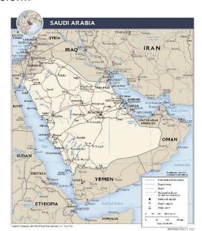
Fig 1. City logistics and Transportation Map in Saudi Arabia

reach almost SAR 94 billion (USD $ 25 billion) by 2020 (https://www.investsaudi.sa/. 2020). It is this strategic location that has increased the inflow of Foreign Direct Investment FDI which has brought the economy of the Kingdom of Saudi Arabia in the last five years to a qualitative leap and placed it at the forefront of economic reform