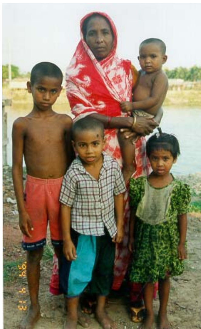
A woman with her children

Approximately 28,000 maternal deaths occur every year in Bangladesh due to pregnancy and delivery-related complications, while many more women suffer major physical and psychological injuries. Available statistics indicate an increase in Menstrual Regulation (MR) and abortions, and most of these are performed by untrained practitioners under unhygienic conditions. The official estimate indicates that about 120,000 MR/abortions are performed every year, but unofficial estimates put it as high as 800,000 (Akhter 1986 and Rochat et al. 1981). Many of these MR/abortions result in serious maternal morbidities and/or deaths. According to Kamal (1993), approximately 8,000 women in Bangladesh die each year due to abortion-related complications.