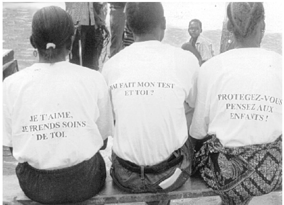
Members of REVS+ in Burkina Faso wear prevention messages during an HIV/AIDS awareness-raising campaign. From left to right: "I love you--I protect you," "I've been tested; have you?" and "Protect yourself--think of the children."

Nonetheless, respondents in all four countries reported drawbacks to PLHA involvement, depending on the activities carried out and the level of visibility. For example, when delivering care and support services, the psychological health of asymptomatic PLHA can be impaired as a result of contact with those who are very sick. In