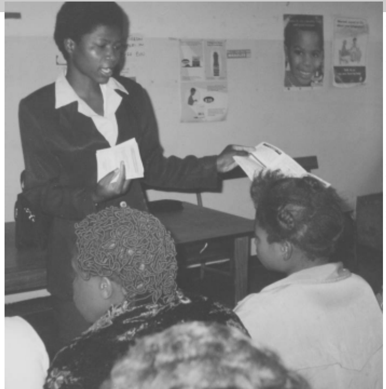
The work of HIV-positive outreach educators at Kara Counselling: HIV/AIDS educators with mothers receiving antenatal care at a local clinic in Zambia.

To address this gap, the Horizons Program and the International HIV/AIDS Alliance conducted a study of PLHA involvement in NGOs in Burkina Faso, Ecuador, Zambia and Maharashtra State, India, between October 1998 and August 2001. The goal of the study was to identify the conditions that foster PLHA involvement