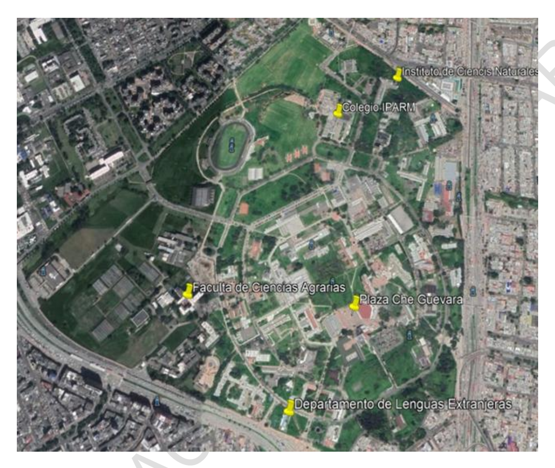
Figure 5. Location of measurement points [10].

measurement points (Figure 5) distributed in the cardinal points and a central one, with which it is intended to analyze most of the area.