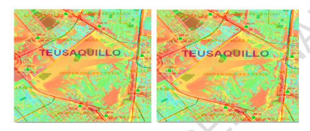
Figure 3. Simulation samples at 3 GHz (Left sunny day, Right rainy day)).

100 GHz, Figure 3 and 4. Coverage simulations of the received power level are performed, from which the results are obtained for analysis in the study area with the settings established for a sunny day and a day with moderate rain.