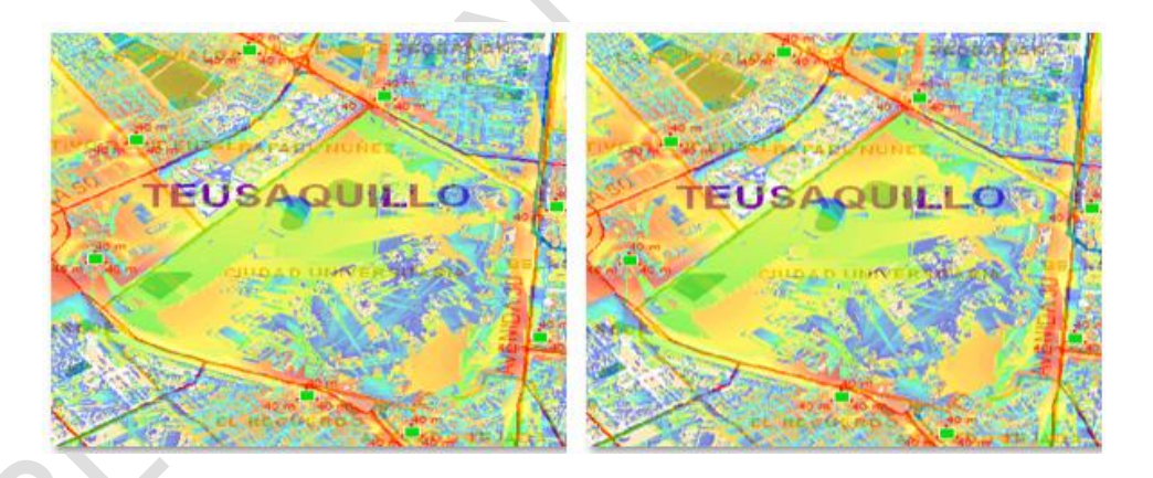
Figure 4. Simulation samples at 100 GHz (Left sunny day, Right rainy day).