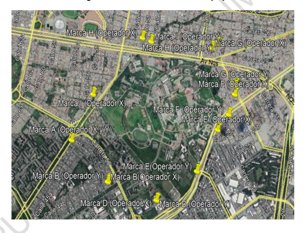
Figure 2. Location of base stations [10].

Universidad Nacional de Colombia (Bogotá). This scenario has different characteristics for the propagation of signals, from the point of view of telecommunications engineering, within which we have leafy wooded areas with trees of great height and size, these areas are located at various points within of the University. Also, we have both green and concrete open areas, Figure 2. It is the perfect setting to analyze electromagnetic signals for NLOS systems (without line of sight); where no base station has the ability to have a direct line of sight.