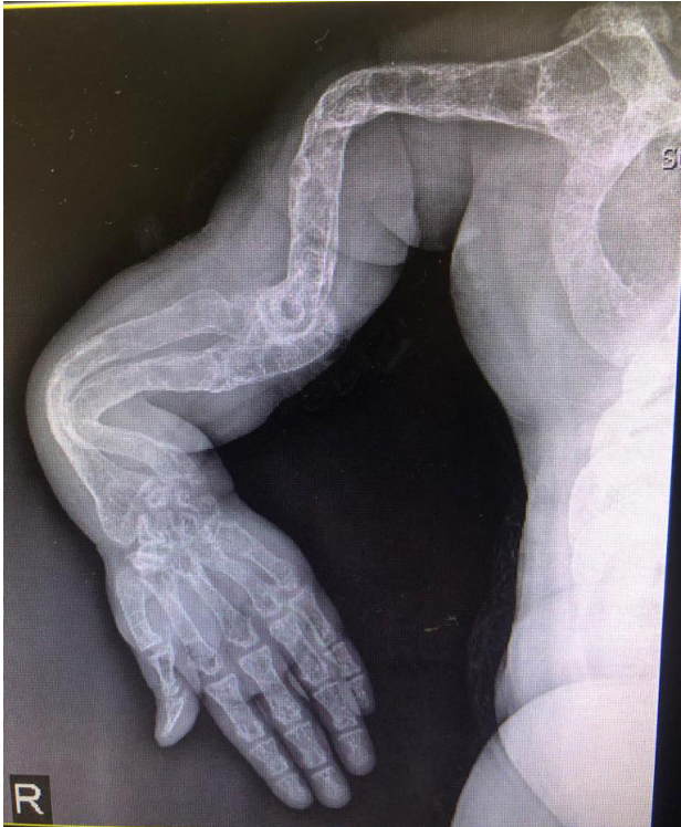
Figure 2: X-ray reveals severe bowing of the upper and lower limbs and marked generalized osteopenia.

SGOT = 66 U/L, SGPT = 54 U/L, bilirubin total = 2.04 mg/dL, direct bilirubin = 0.63 mg/dL, serum alkaline phosphatase levels were elevated at 312 IU/L, and lactate dehydrogenase (LDH) = 496 U/L.