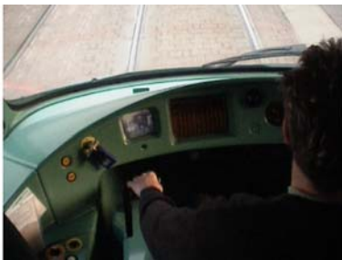
Figs. 9-11 Eurotram control cab—throttle, alarm and dead-man—action on the throttle

driving called "preventive", which consists of releasing traction and coasting as soon as possible, while the driver is moving his foot in front of the brake pedal.