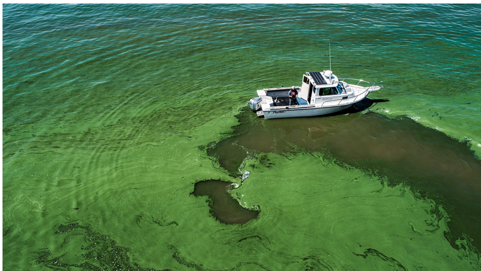
FIG 1 Massive Microcystis bloom (3 August 2019) near the mouth of the Maumee River (Ohio) is typical of recent events. (Used with permission from David J. Ruck/Great Lakes Outreach Media).

still unable to answer the common question raised by the citizen constituents: “Why do we get Microcystis blooms?” Here, we present a discussion on the many factors influencing bloom formation, persistence, and decline and the research efforts required to understand them.