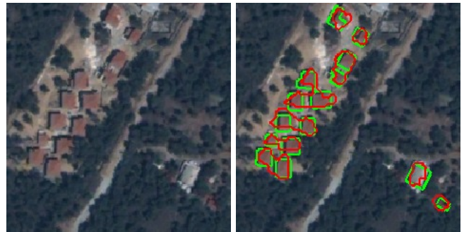
Fig. 1. Automated building detection from very high resolution multispectral data. The developed algorithm managed to detect efficiently scene’s buildings. The ground truth data are shown with a green color, while the detected buildings with red.

Very high resolution (VHR) satellite data are absolutely required for tackling the specific problem, while any spectral information more than the standard RGB enhance significantly the discrimination capabilities between the different man-made objects, soil, etc. Moreover, elevation data like Lidar, DSMs, etc can significantly ameliorate the detection pro-