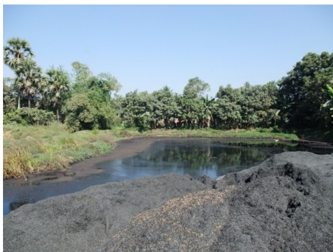
Illustration 3: Unmanaged solid waste from rice husk gasification in Cambodia.

It is estimated that Vietnam produces 8 million tons of rice husk per year, and only 40% of it is being utilized mostly for traditional purposes. The excess amount of rice husk could become a considerable source of energy. Regarding lignocellulosic biomass, gasification is a promising route for the conversion of this type of biomass into "useful energy": heat, electricity or motive power. Gasification is a process that converts organic or fossil fuel based carbonaceous materials into syngas, a fuel gas mixture consisting primarily of carbon monoxide (CO) and hydrogen (H 2 ). The syngas is