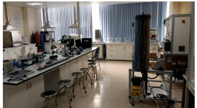
Illustration 2: CleanED lab in USTH room 610, October 2015.

Setting up a lab's information infrastructure is as important as the physical infrastructure. We used a mix of solutions, mostly in the cloud and external from the University. Domain, web and blog hosting are purchased from a commercial provider, Gandi. For file sharing we use Dropbox. The 2Gb storage capacity of the free plan is not enough for our needs already. For email, agenda, collaborative document editing, and mailing list we use Google. Both the price and quality are the best possible, but this was a choice dictated by