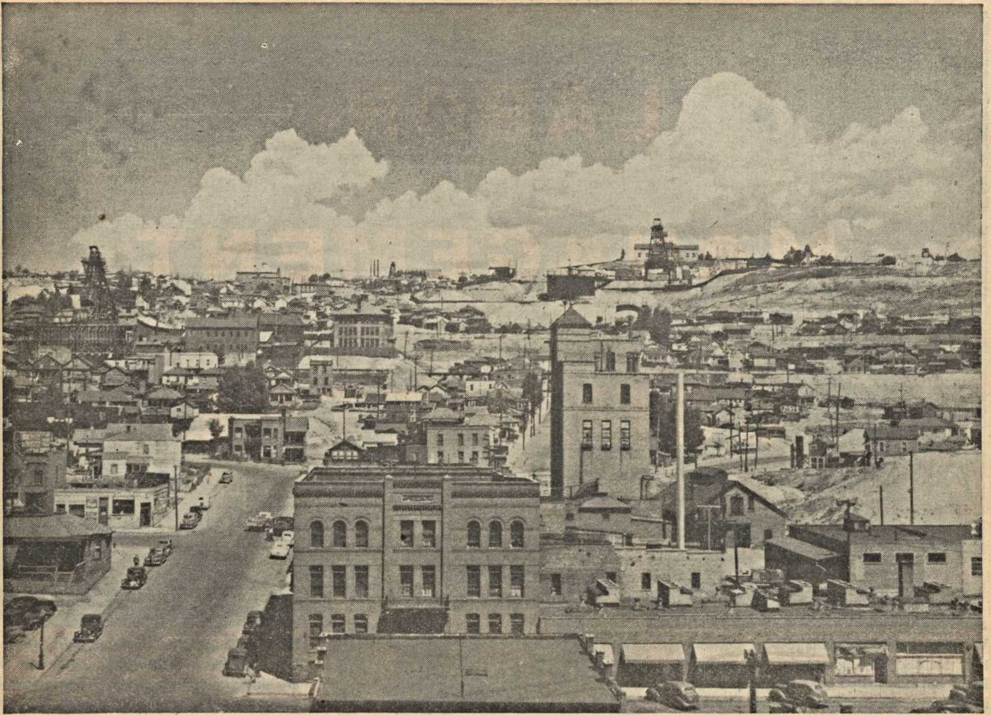
Here is a view of Butte, the city in which this Labor-Management Committee operates