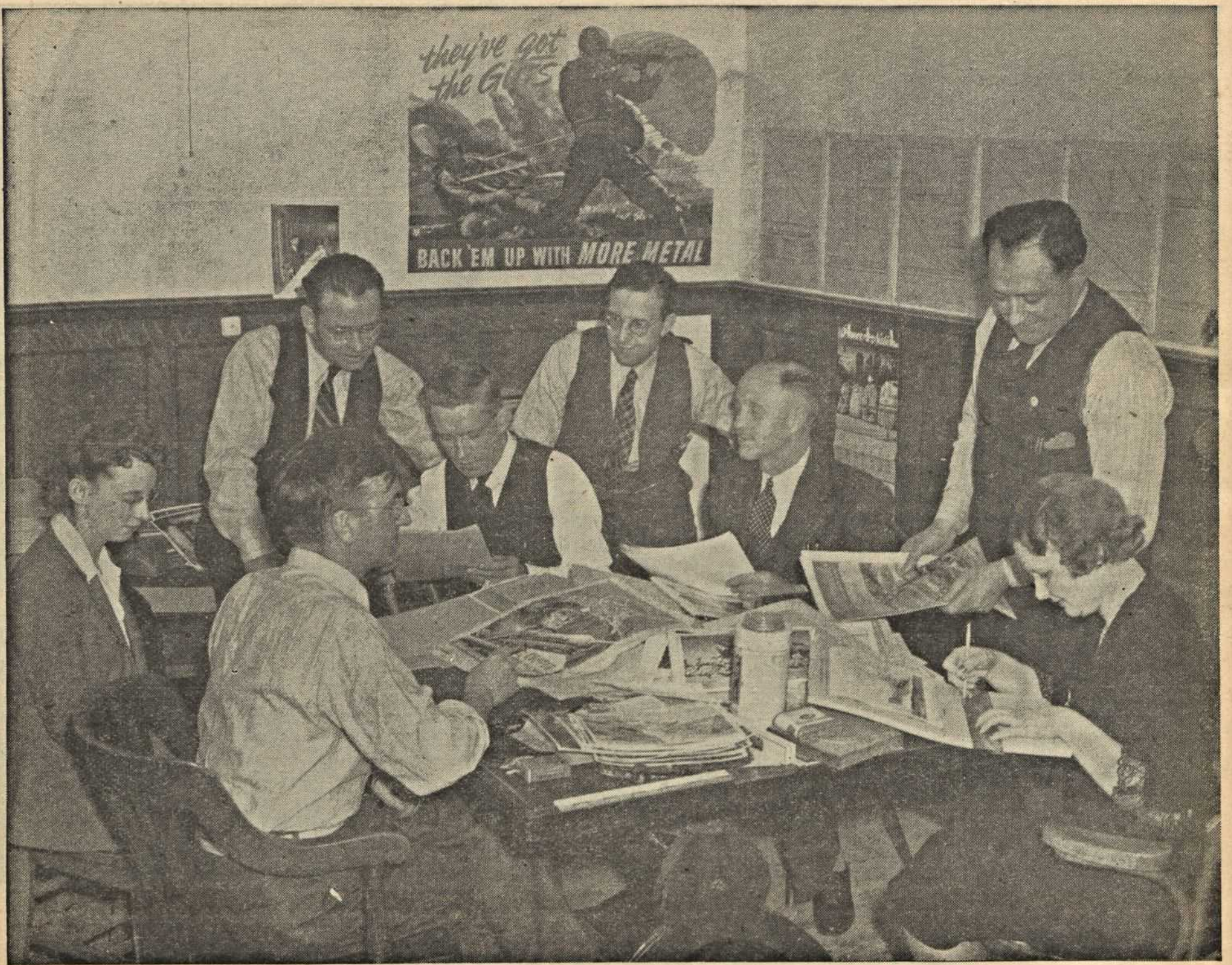
This is the Butte Editorial Board discussing an issue