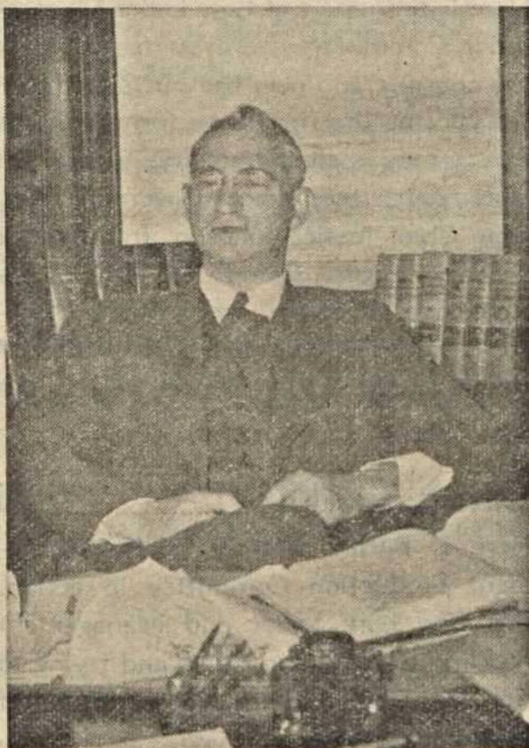
CHIEF JUSTICE HOWARD A. JOHNSON

OUR authoritarian enemies, who believe in compulsion rather than co-operation, are due for quite a shock. Their plan is for complete control of people by the government, instead of control of government by the people. They think that because citizens cannot easily be regimented by their own representatives, a representative government is too weak and inefficient to survive.