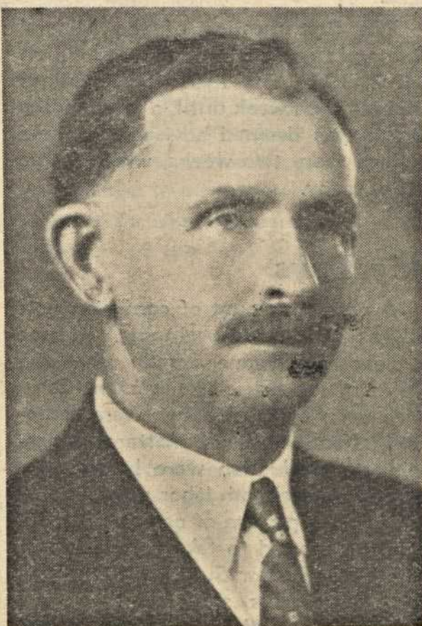
MAYOR BARRY O'LEARY

Other activities included special production problems, such as cost reduction, machine tool capacity, idle time, gas and air and electrical equipment, mine and plant housekeeping, fire protection, plant protection, movies, letters to service men, book collections, employment, music, uni-