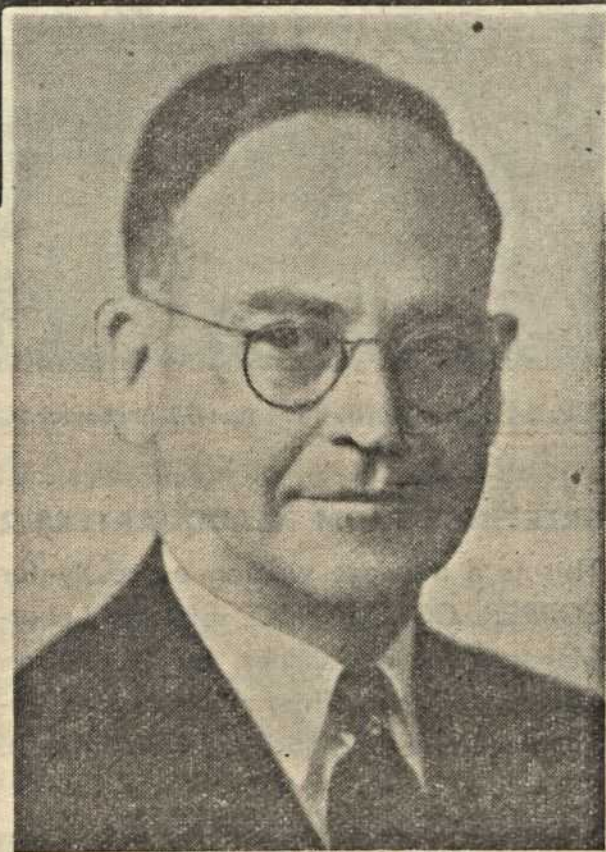
GOVERNOR SAM C. FORD

—SAM C. FORD, Governor, State of Montana