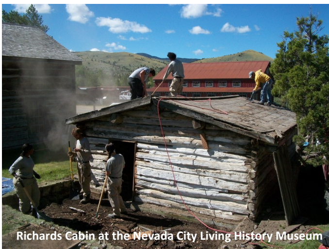
Richards Cabin at the Nevada City Living History Museum