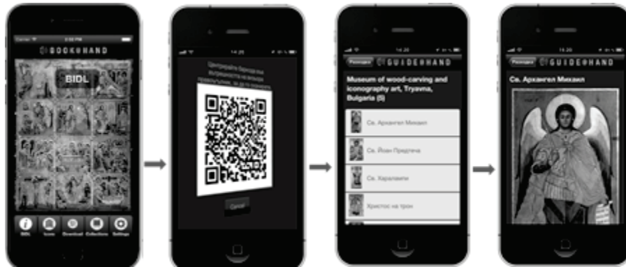
Fig. 1. Observation of an iconographical masterpiece from the Museum of wood-carving and iconography art, Tryavna, Bulgaria by using the BOOK@HAND platform

selected collection. The BOOK@HAND mobile application can read this QR code, and then download the collection. The mobile application stores locally the downloaded collections and presents the downloaded icons and the related descriptions.