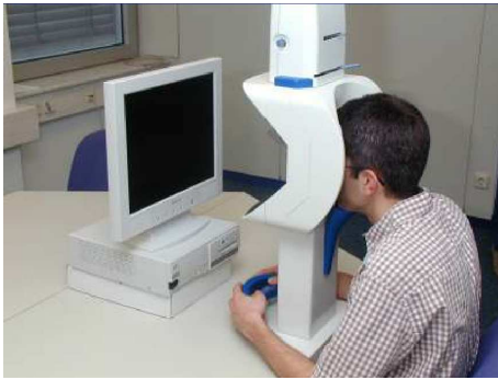
Figure 1: The eye tracker device in use (SensoMotoric, 2005).

window or scroll inside it up and down. Since the advertisements have usually dynamic content (e.g. flash animations), each of them is considered as a sequence of images, which are given at the beginning of the tests. Therefore, the procedure can be considered as a 2D template matching task from computer vision. In this paper, a fast template matching method is proposed, which can work in real time in the context of the above application. At the end, we validate our solution via real test data , and quantitatively show the gain in recognition rate and processing time versus a reference approach.