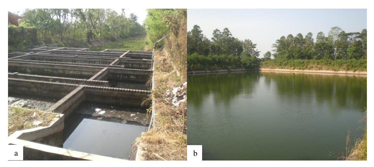
Fig. 3. Wastewater treatment and conservation design in pesantren Al-Zaytun: a. Wastewater management; b. The reservoir, dependent on wastewater treatment and rainfall.

availability (stock) has a key role in achieving land productivity, and for this reason, pesantren Al-Zaytun attempted sustainable reservoir development based on wastewater treatment (management) and rainfall (Fig. 3).