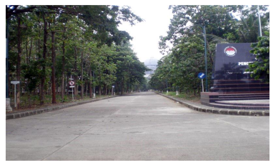
Fig. 2. The green development of pesantren Al-Zaytun.

air, mild, pleasurable nuance, consequently forming an ecological equilibrium, while creating a suitable habitat for plants and animals, to achieve increased biodiversity.