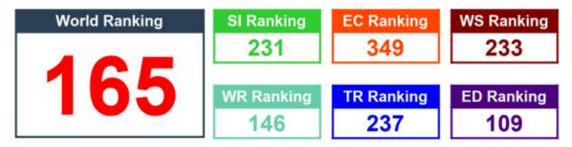
Figure 3. Results summary of Ton Duc Thang University [6]

It can be seen from Fig. 3 that in 2019, the categories of Education (ED) and Water (WR) of TDTU was ranked in the top 200 with ED ranked the 109^{th} and WR ranked the 146^{th} . Specifically, data of each category of TDTU was verified by UI GreenMetric highlights as presented in Table 1.