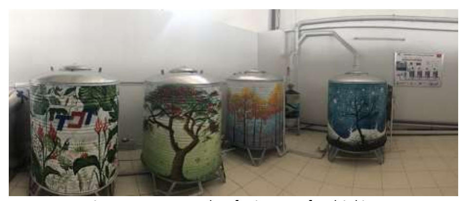
Figure 5. Water tanks of rainwater for drinking

The University has implemented several water recycling programs. Particularly, TDTU installed a waste water treatment system with the capacity of 1200m3 per day in Tan Phong campus. Moreover, the University installed water tanks to store rainwater and treat it to make it possible for drinking (Figure 5). These programs were still implemented at early state [7].