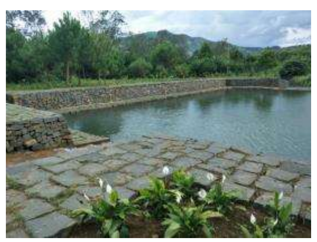
Figure 4. The lake in Bao Loc campus

TDTU has implemented several water conservations programs. For example, the University dug a large lake in Bao Loc campus to store rainwater for tree and grass watering (Figure 4). Fortunately, there are two canals running through the Tan Phong campus. These canals help store water and reduce the heat. We believe that over 50% of water was conserved in TDTU campuses [7].