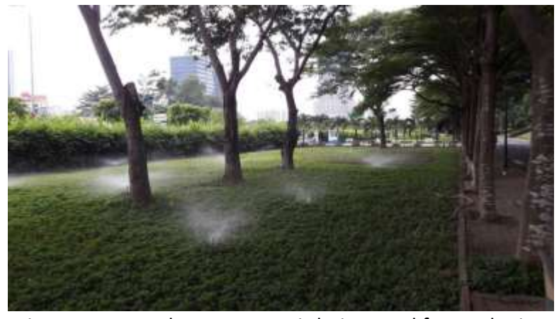
Figure 7. Treated waste water is being used for gardening

As discussed in section 5.2, TDTU installed a waste water treatment system. Therefore, treated water was consumed in many activities. Specifically, the University have been using treated waste water for gardening, cleaning and washing floors and facilities in outdoor activities (Figure 7). At TDTU, we are proud to say that more than 75% of treated water was consumed [7].