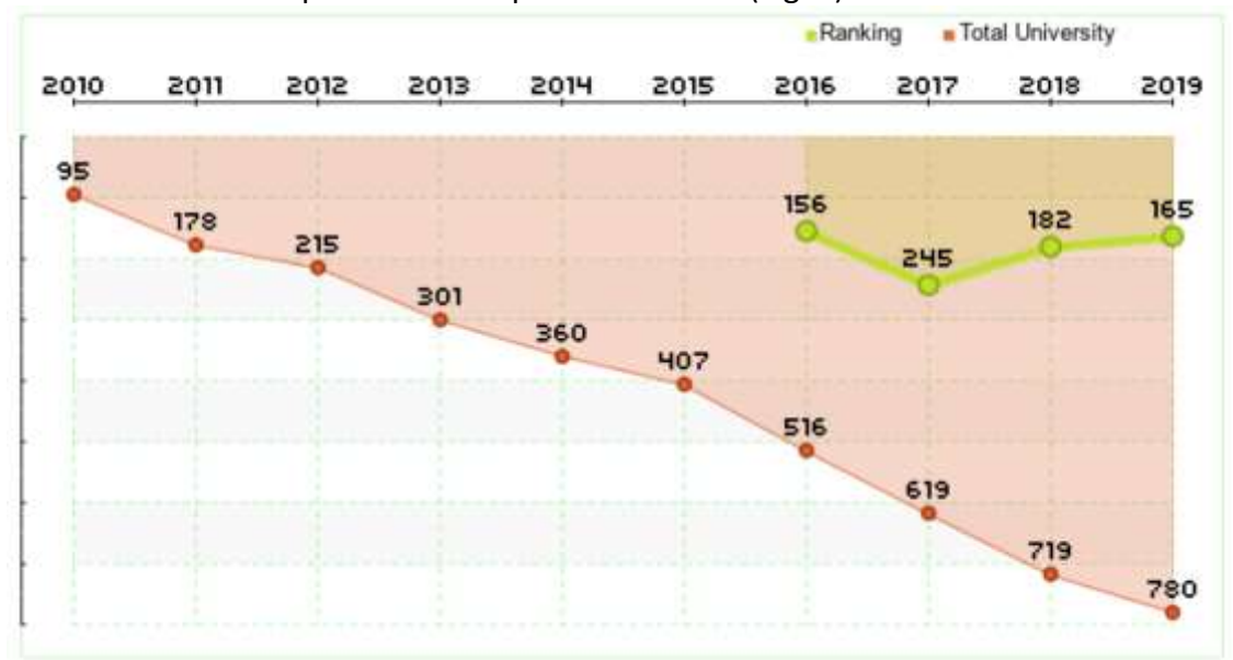
Figure 1. World ranking history of Ton Duc Thang University [6]

Ton Duc Thang University (TDTU) began taking part in UI GreenMetric in 2016, and does it annually up to present. TDTU has always been ranked the 1<sup>st</sup> in Vietnam, and ranked in the top 200 worldwide except in the 245<sup>th</sup> position in 2017 (Fig. 1).