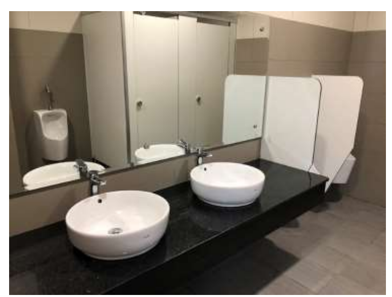
Figure 6. Water saving taps are being used

Water efficient appliances have been installed in all buildings of the University, particularly restrooms and hand washing places. TDTU only used modern appliances that save water, for example dual-flush toilet and water saving taps (Figure 6). In TDTU, more than 50% of water efficient appliances were installed [7].