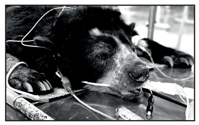
Figure 2. Case 2 bear submitted to general anesthesia.

N.A. Garofalo, A.A. Justo, S.C.M. Araújo, et al. 2021. Dexmedetomidine-Tiletamine-Zolazepam Followed by Inhalant Anesthesia in Spectacled Bears ( Tremarctos ornatus ). Acta Scientiae Veterinariae. 49(Suppl 1): 661.