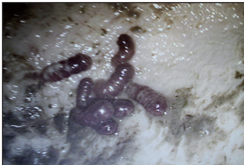
Figure 1. Image of Gasterophilus intestinalis larvae attached to the stomach lumen of a weanling foal. Gastroscopy exam was carried using a flexible endoscope (Olympus) through nasogastric access.

*There was not observed difference between groups ( P > 0.05 ). SD= Standard deviation; 1 MCV= Mean corpuscular volume; 2 MCH= Mean corpuscular hemoglobin concentration.