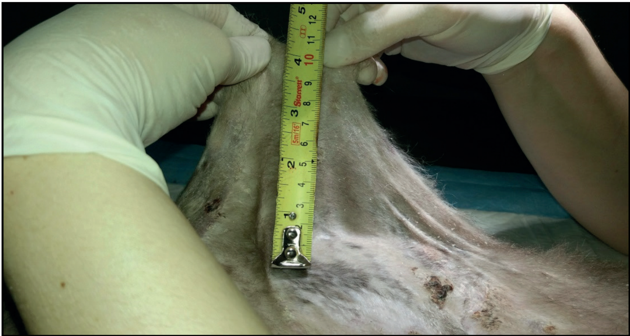
Figure 2. The value of a vertical measurement (11 cm) was obtained from the fold at the level of the lumbar dorsum of a 3-year-old male castrated, no defined short hair race cat.

increased cortisol caused by stress, it is observed by increased leucocytes in the patient's blood count (stress leucogram) [6].