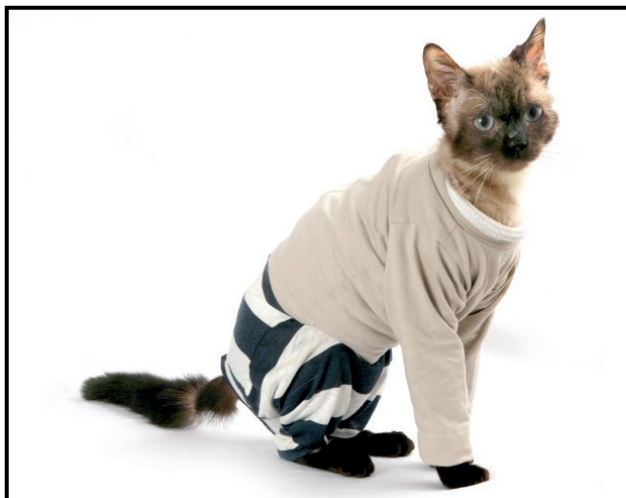
Figure 3. Treatment using padded clothing in a 3-year-old male cat.

Through histopathological findings in the dermis of areas with hypertrophy and fibroblast hyperplasia, disorganization of the collagen fibers, and variation in size and shape, the collagen presents with variation in size and orientation of the bundles and fragmentation using Masson's Trichrome staining (Figure 4) [7,16,17], the diagnosis of skin asthenia was confirmed.