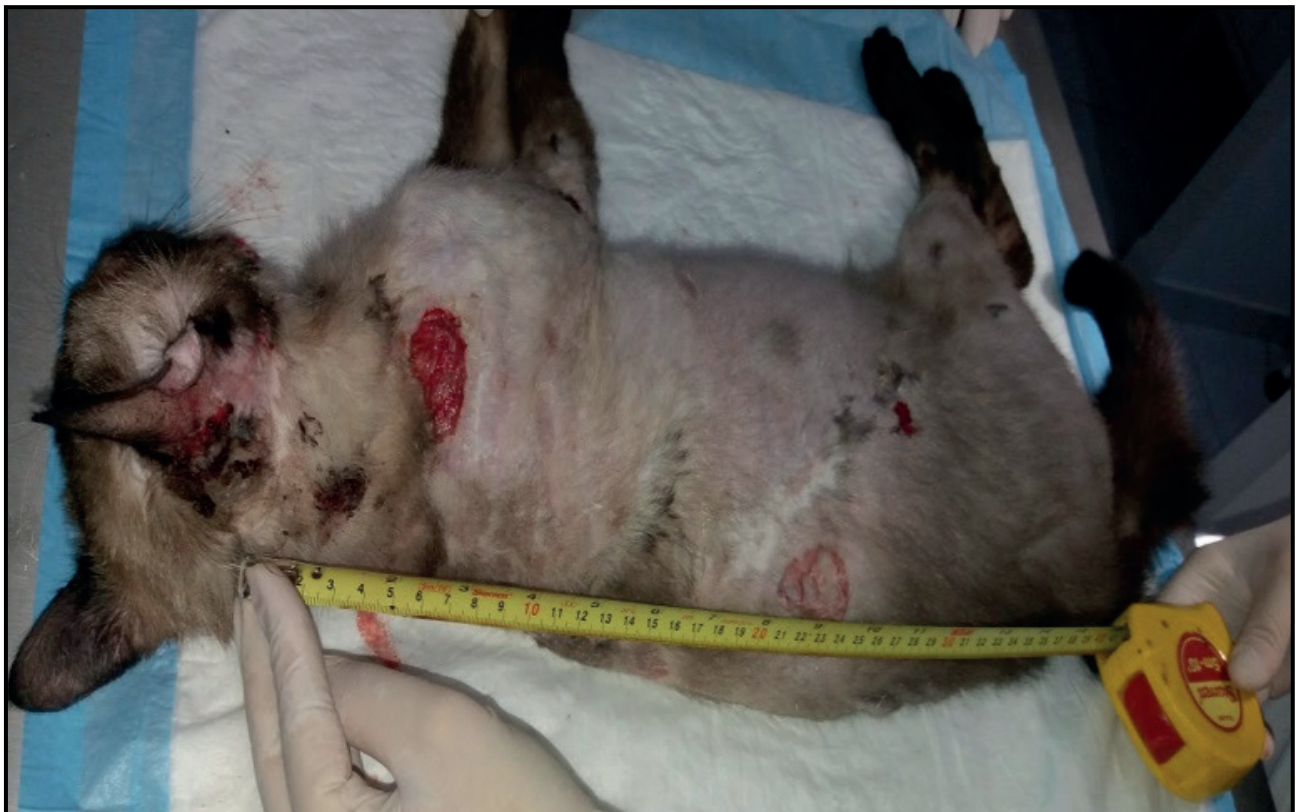
Figure 1. The value of the body length measurement (40 cm) was obtained from the occipital ridge measurement to the base of the tail of a 3-year-old male castrated, no defined short hair race cat.

Diabetes mellitus is associated with obesity and persistent hyperglycemia, the patient was not obese (4 kg) and in his biochemical examination, there was no change in the fructosamine, despite the small increase in glucose. [3]. Increased glucose may be related to