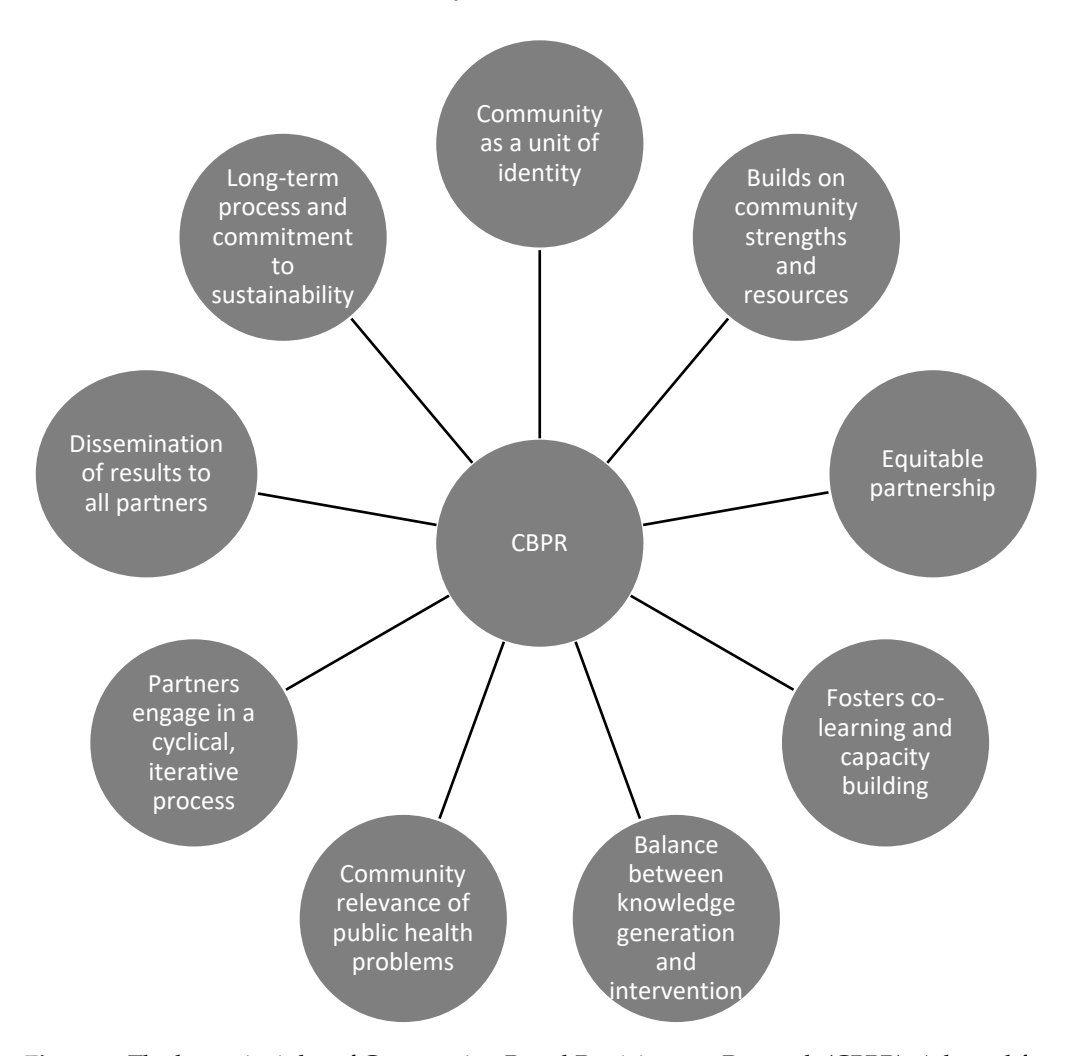
Figure 1. The key principles of Community–Based Participatory Research (CBPR). Adapted from "Methods for Community-Based Participatory Research for health" [18] (pp. 9–11).

developed on trust and mutual understanding over time [22]. Although, the core principles of CBPR partnerships may be similar across academic-community alliances, each community setting will have its own strengths and challenges unique to the social context and characteristics of that community [30].