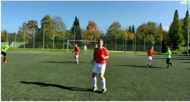
Fig. 1 ▲ Example of a midfield scene used within the first-person perspective video-based decision-making diagnostic instrument

the effects of age groups and playing position, the number of measurement points served as a manifest covariate. This was to assess whether the number of measurement points influenced the result pattern and statistical decisions with respect to age groups. As there is no statistical procedure controlling for a covariate in nonnormal distributional properties, ANCOVAs (analyses of covariance) were conducted in addition to Mann–Whitney–U-tests (post hoc analysis) to assess for possible influences of the number of measurement points on the results.