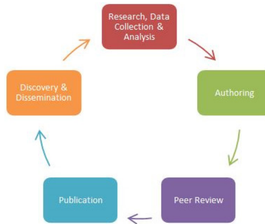
Figure 1. Lifecycle of scholarly communication (ACRL)

recipe emphasizes that the catalog is not a passive description of materials but a site of active and critical collection and description of materials in ways that shape discovery and dissemination.