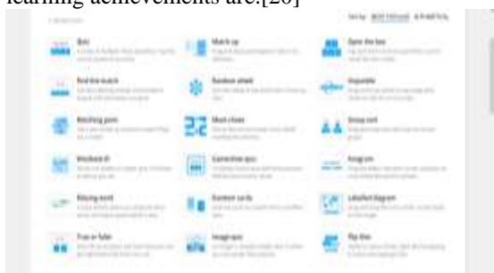
Figure 2. Wordwall Template Display

Wordwall is an application that can be used as a learning medium and also as an interesting assessment tool for students [20]. This application has the advantage of being easy to access and free in basic options with several templates. Materials or assessments in the form of games after they are made can be sent directly via whatsapp, google classroom, or others. Another advantage is that the games that have been made can be printed in PDF form, so it will be easier for students who have problems with the network. Wordwall can make it easier for students to understand subject matter online, and easy to use to find out how students' learning achievements are.[20]