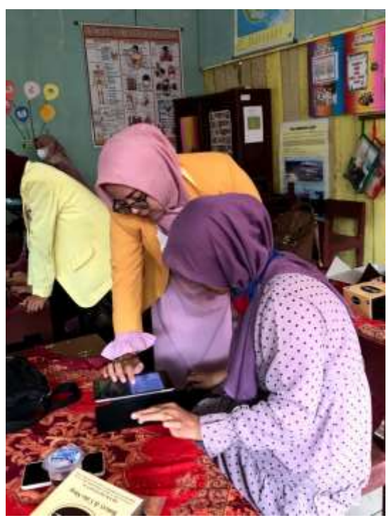
Figure 7. Account creation assistance