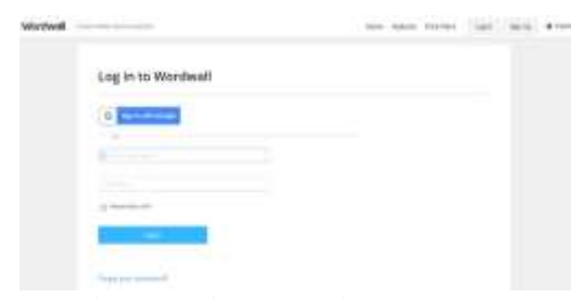
Figure 6. Display Log in on Wordwall

After knowing the function of each of the available templates, the teachers were directed to create their own accounts. Previously, it was informed that teachers should provide laptops or tablets and also an internet network. Account creation begins by logging in using your personal email and password.