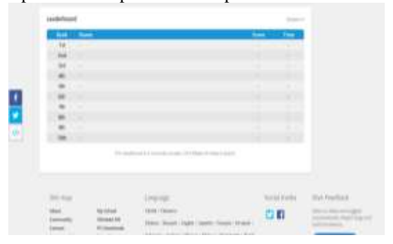
Figure 3. Display of student test results that are directly inputted in the application

image quiz, open the box, unjumble, group sort, anagram, labelled diagram and flip tiles. Template selection depends on the material to be tested. Not all templates are in accordance with the material to be tested, therefore in its preparation it takes the creativity of the teacher to process it. In addition to the several template options above, you can also use a premium template that was purchased in advance.