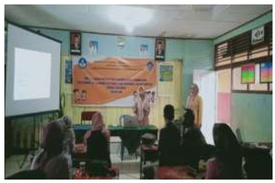
Figure 8. Assistance in making assessments using Wordwall