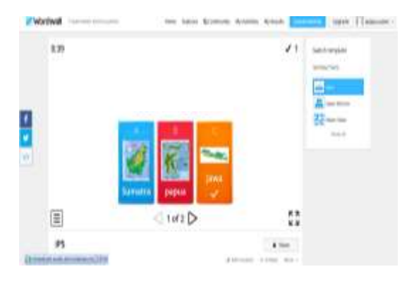
Figure 4. Display Templates in Quiz form

The introduction begins with the provision of material about the benefits of the wordwall application to support the learning process. Wordwall can be used as an assessment media that can make it easier for teachers and students during online learning. At this stage, it is also introduced to share the functions of the templates available on the account. Various wordwall templates allow teachers to provide diverse and interesting assessments for students. In addition, the application also displays the results of assessments that have been done by students directly. This is useful for motivating students to be more diligent so that their scores are not left behind by other students.