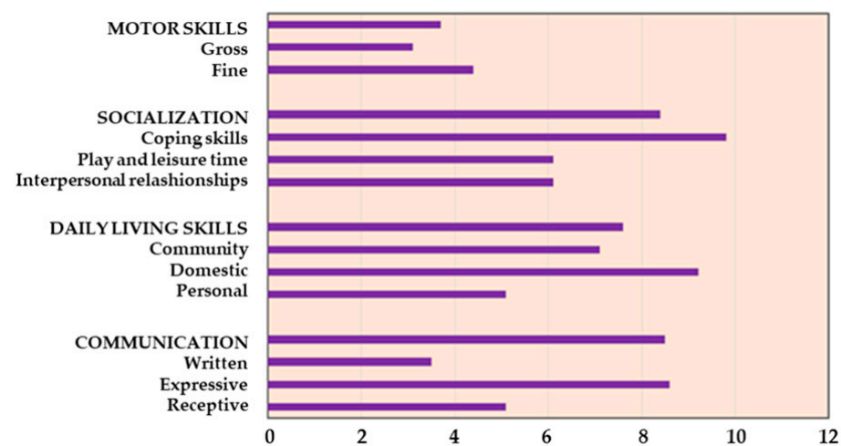
Figure 1. Evaluation of equivalent age according to Vineland Adaptive Behavior Scales.

Psychological assessment with Vineland Adaptive Behavior Scales showed an equivalent age lower below the mean age (12.2 years) in our population for all the abilities. Specifically, it indicated an average age of 3.7 years for motor skills, 7.6 years for daily skills (including eating, dressing, personal hygiene, housework, etc.), and 8.4 and 8.5 years for socialization and communication, respectively (Figure 1).