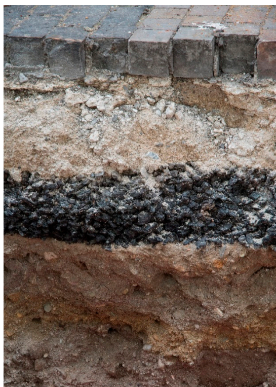
Figure 1. Layering of a sealed Technosol: artificial and natural materials are superposed to reach the prescribed level.

It is therefore not surprising that several cities in Europe have promoted, in recent years, public intervention programs for degraded urban soils with new integrated approaches at the social, economic, and cultural level as suggested by the URBAN-SMS project [33,34].