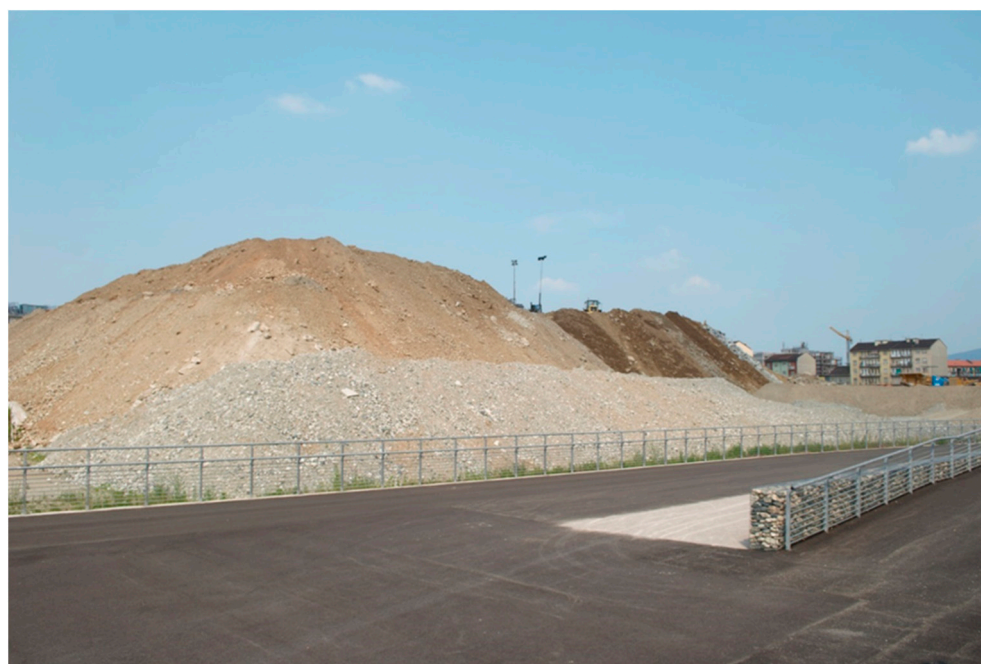
Figure 2. An example of urban excavated soil material that can subsequently be employed for constructed technosols.