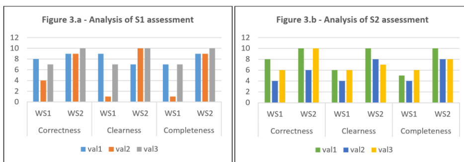
Figure 3. Analysis of the assessment received by the students S1 and S2

More in depth, we show, starting with two samples of students from the University of Turin, how the FA strategy could enhance the students' argumentation competence according to the peers' assessment. Specifically, we consider the feedbacks received from the students' assessors referred to workshops WS1 and WS2, whose topics of these workshops are quite similar. Figure 3.a shows the marks assigned to the student S1 for each criterion from the three peer assessors, named val1 (navy line), val2 (orange line) and val3 (grey line), referred respectively to WS1 and WS2. Analogous data are shown in Figure 3.b for the student S2 (the three peer assessors are again named val1 – green line, val2 – blue line, val3 – yellow line, but they are not the same students as in the case of S1).