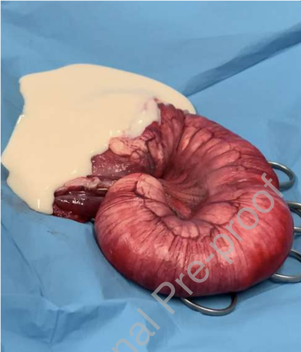
Fig. 3. Appearance of the uterus that was removed from the patient in Figure 1. A longitudinal section was performed, and the white exudate filling the organ leaked onto the surgical drape.