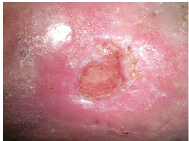
Figure 3 Wound dimension 2.5 cm × 1.5 cm after 30 days of treatment.

Of the latter six patients, four (36%) reported a similar reduction with a decrease of the average VNS from 9.3 to 3.2 in the same 7-day period. The latter two patients (19%) had very severe pain that required daily treatment with morphine-like painkillers. Both patients reported a strong pain reduction from an average VNS of 9.5 to VNS 2.5 after just 1 week of