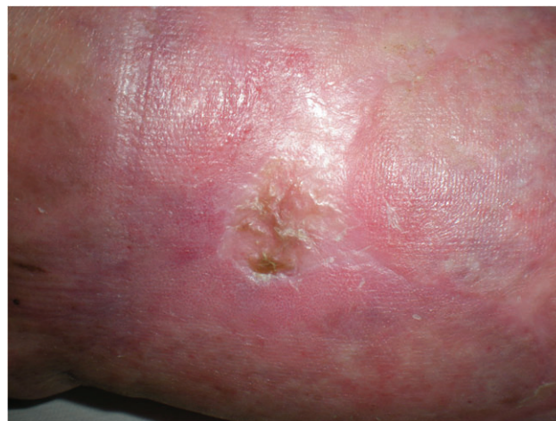
Figure 6 One hundred and twenty days after bioelectrical signal therapy (BST) positioning. As shown, complete reepithelisation can be achieved even 2 months after suspension of BST treatment, due to the reactivation of physiological ion current within the wound.

The ES of the BST derives from the combination of a rectangular pulse train and a stochastic (random) signal to create a 'noise'. This noise is an integral part of the normal