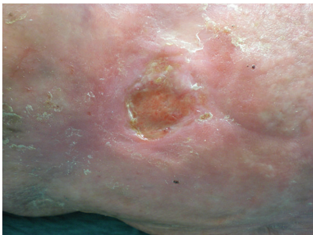
Figure 4 Wound dimension 1.5 cm × 1.5 cm after 50 days of treatment. Treatment with bioelectrical signal therapy (BST) is stopped.