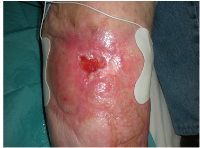
Figure 2 Same patient in Figure 1, during treatment. Bioelectrical signal therapy (BST) device applied close to the wound. During treatment, no other type of advanced dressing was used.