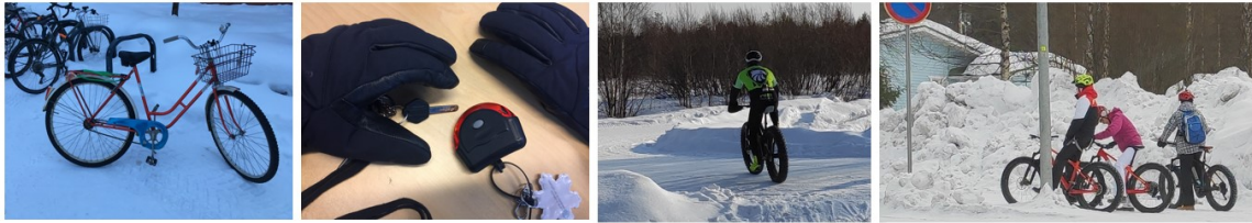
Fig. 1. Winter cycling requires handling cold, snowy and dark biking conditions, and takes place both in the urban environment and outback tracks.

practical means for commuting, promoting at the same time sustainability and a healthy lifestyle. Generally, many of the concepts and prototypes related to HCI while biking are related to safety. For instance, Dancu et al. have explored projection to improve the visibility of turning signals [2], and Matviienko et al. audio, haptic, and visual warning signals for child cyclists [8]. Today, mobile phone usage is truly omnipresent, and they are used also during sports and commuting activities, including cycling [7]. This has led to attempts to improve the safety of bikers (and the people surrounding them) while using a mobile phone, so that the visual attention of the biker would not leave the road and hands could be kept in the handlebars. For instance, concepts and prototypes suggesting smart phone controls attached to the bike [16], or providing navigation information projected on a heads-up display or on the road [2], or with a vibrating tactile belt [13], have been suggested. These examples illustrate that the topic of technology use while biking inspires HCI researchers, who are seeking solutions that could be used by large masses of users in the future.