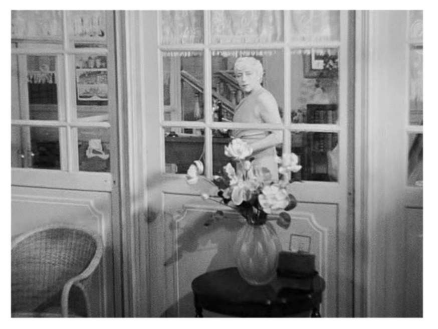
Figure 2 Framing Louise's increased susceptibility to the public's moralizing gaze.