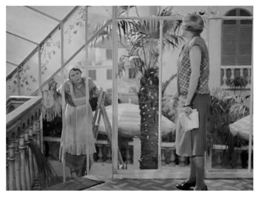
Figure \ \imath Louise surveys the upper floor of the boarding house.