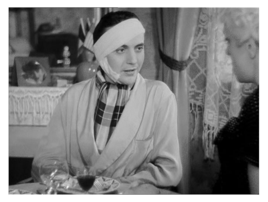
Figure 5 Feyder's mise en scène foreshadows Pierre's increasingly tense presence as a disputed object of Nelly and Louise's desire.