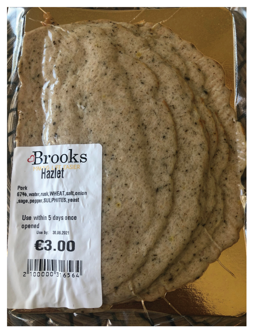
Plate 1. Hazlet on sale in Brooks Market, Riverchapel, Co. Wexford.

influence of marketing on the public's food-making decisions. A survey by the FSAI<sup>35</sup> in 2012, found that 45% of small food businesses believed that food safety standards were stricter than they needed to be, while a survey by Bord Bia<sup>36</sup> in 2012 found that up to 30% of people in Ireland claimed to have changed their eating habits in order to be healthier. Furthermore, a Bord Bia consumer insight report 'What Ireland ate last night', a study into evening meal consumption, suggests that Ireland has experienced socio-economic and technological changes which have significantly impacted the general public's attitude on food choice. Although the report notes that the 'classic' meat and two vegetables remains the most frequently eaten evening meal, other dishes of ethnic origin such as Italian, Chinese and Indian, are commonly consumed.<sup>37</sup> Consumer choice was influenced by cost and health awareness, but also by globalization and increased domestic technology which resulted in certain food traditions and skills becoming neglected.<sup>38</sup>