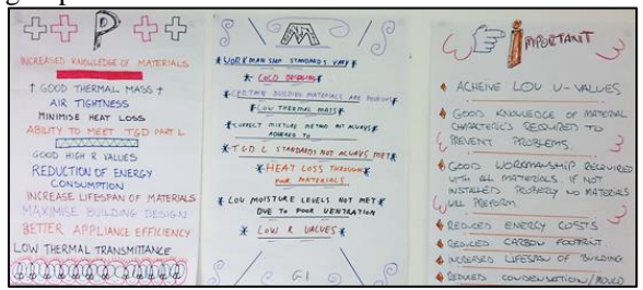
Figure 4: PMI group poster for class presentation

Each group is asked to then present their completed poster to the whole class with a question and answer session following each presentation. This allowed any knowledge gaps to be identified and addressed, as well as promoted problem solving, lateral and critical thinking, complex analysis and group work.